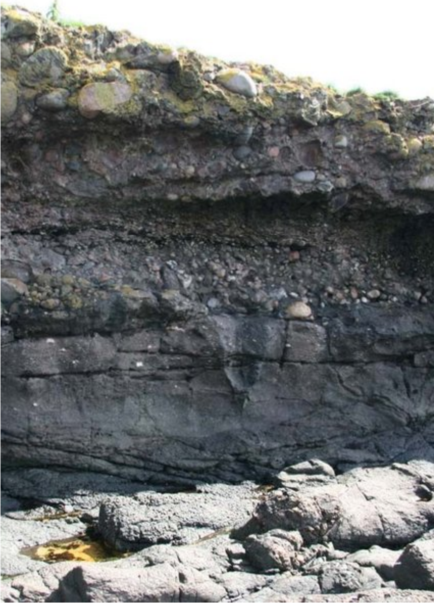
(Figure 2) Coarse conglomerates of the Crawton Group of the Lower ORS resting on the third lava of the Crawton sequence at locality 3.