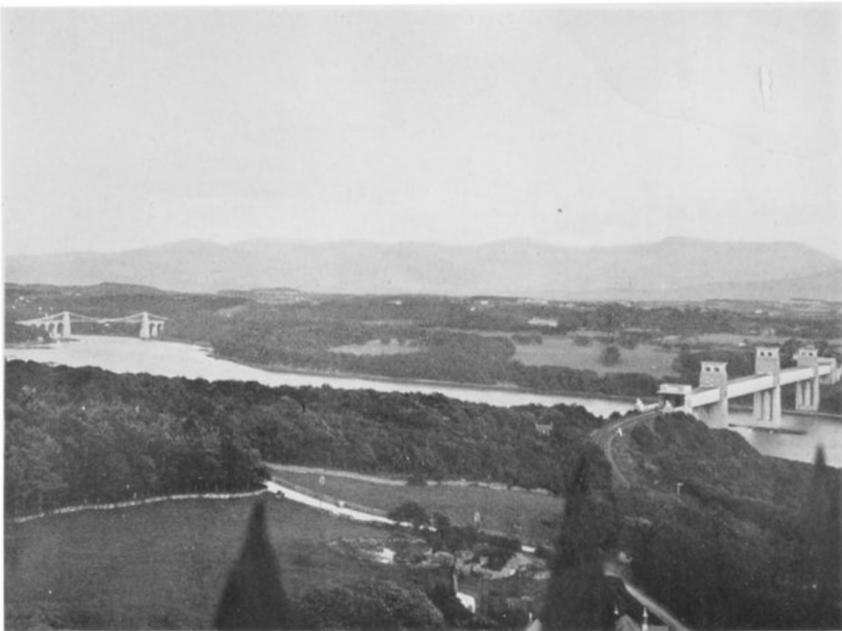
(Plate 52) The Menai Strait at the submerged watershed. Looking towards the Mountain-Land of Wales. From the top of the column..