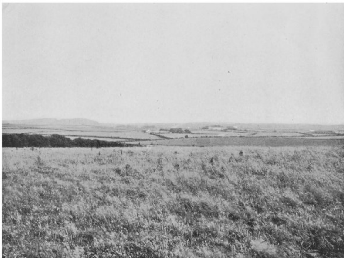
(Plate 50) The Menaian Platform and the Bodafon monadnock. From the roadside at Mynydd-mwyn-mawr, Llanerchymedd.

(Figure 325) The path of the ice. Scale: one inch = eight miles.