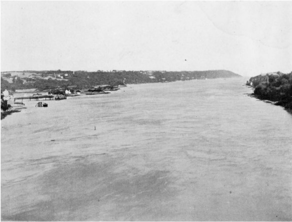
(Plate 51) The Eastern Reach of the Menai Strait. From the Suspension Bridge.