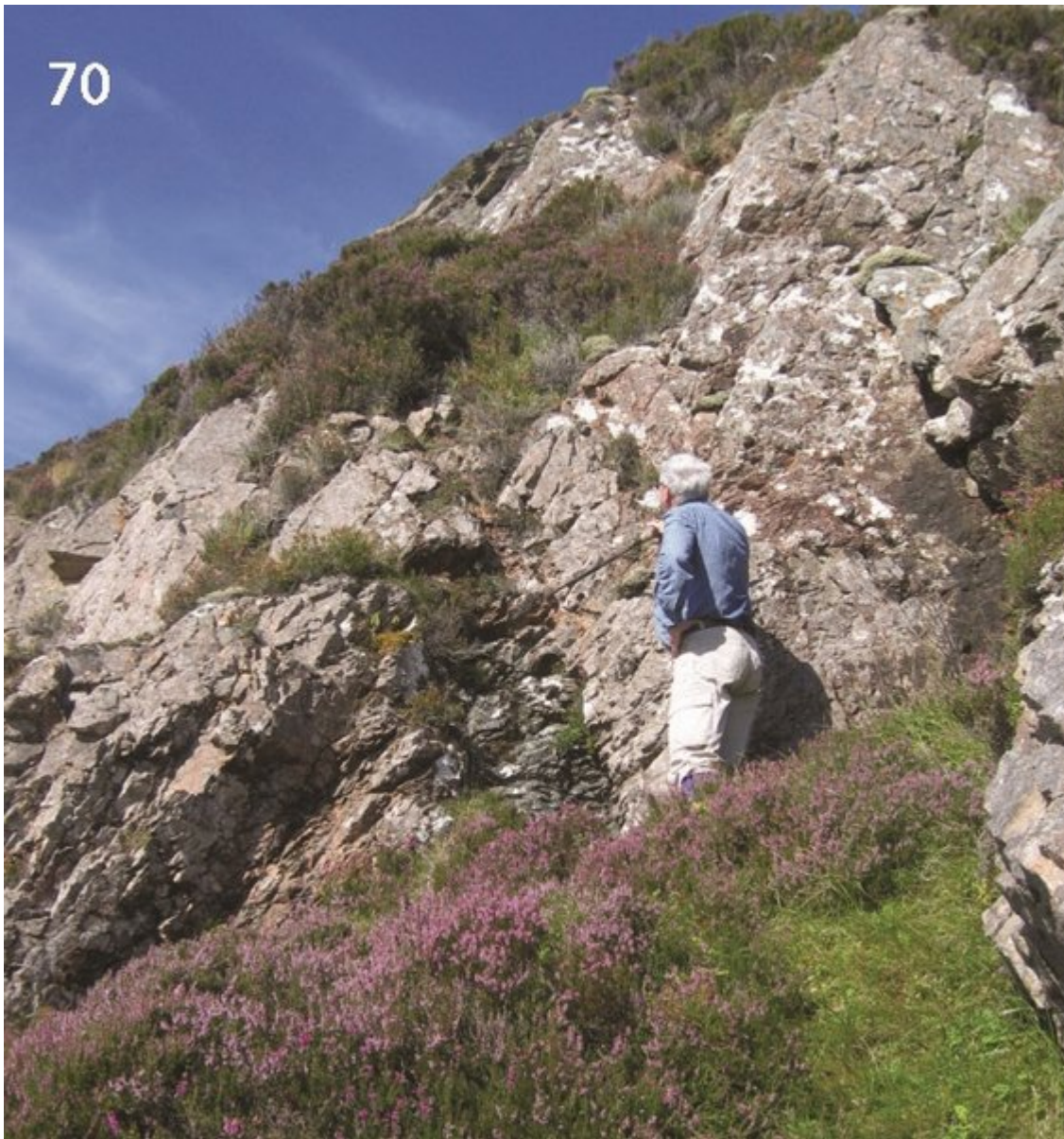
(Figure 70) The overturned, steeply dipping unconformity between Lewisian gneiss and Basal Quartzite Member in the Cam Loch Klippe. The geologist's hand is resting on Lewisian gneisses, but immediately to his left is the weathered-out unconformity, with Basal Quartzite outcrops further left.