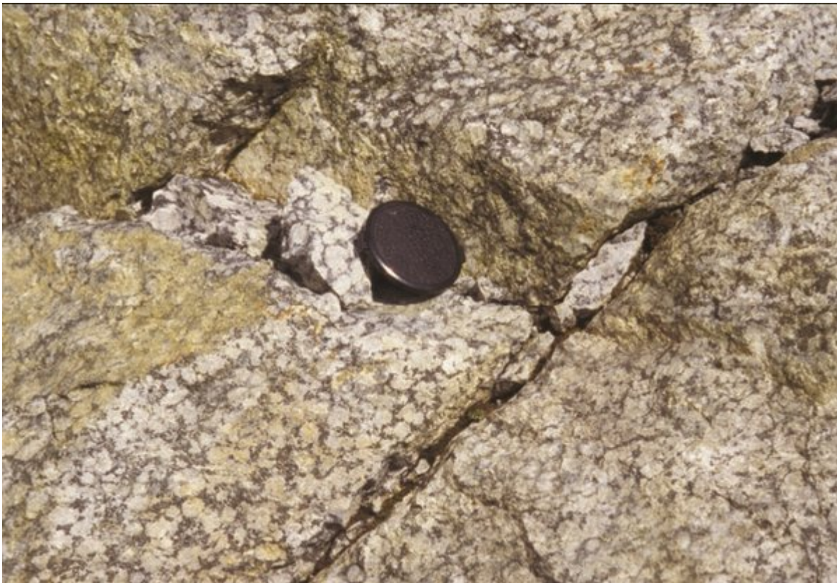
(Figure 73) 'Borolanite' in Ledmore Marble Quarry (Locality 10.3), with the characteristic spotted appearance due to the presence of white pseudoleucites.