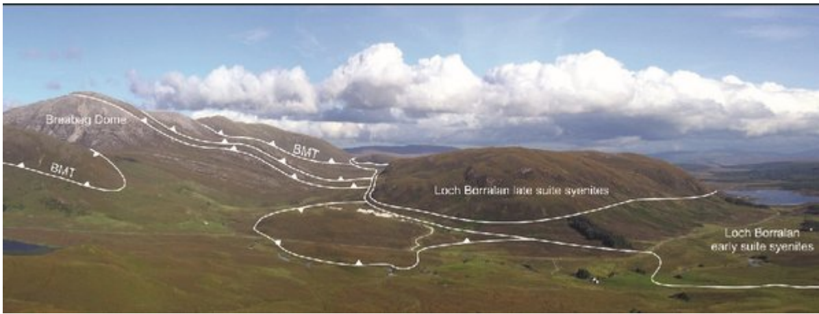
(Figure 72) View east from Cnoc an Leathaid Bhig. The low, dark hill slightly right of centre in the image is Cnoc na Stròine, formed of quartz-syenites of the late suite of the Loch Borralan Pluton. The early suite syenites outcrop in the poorly exposed lower ground around Loch Borralan on the right of the photograph. Some of the main thrusts in the area are indicated (BMT= Ben More Thrust). At a large scale these thrusts are cross-cut by the Loch Borralan Pluton; poor exposure obscures the detailed relations between the early suite syenites and the thrusts.