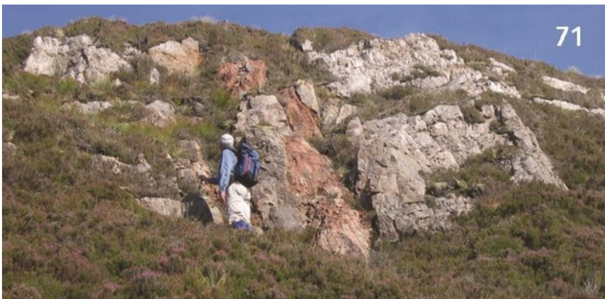
(Figure 71) Red Porphyritic Trachyte dyke, cutting Basal Quartzite Member in the Cam Loch Klippe.