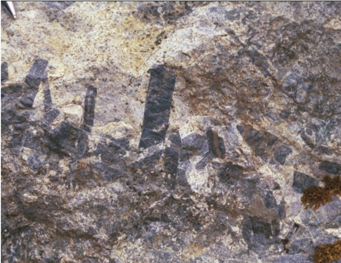
(Figure 74) Pegmatitic syenite in the Bad na h-Achlaise excavation, Locality 10.4.