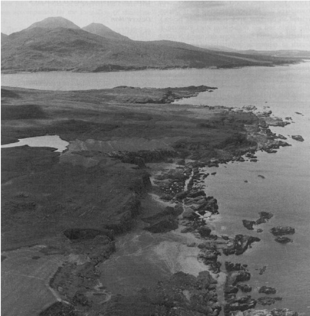
(Figure 11.12) View south along the west coast of Jura between Shian Bay and Ruantallain. Lateglacial shingle ridges extend across a high rock platform and to the west of Loch a'Mhile (centre). The loch was formerly a marine inlet prior to the deposition of the shingle ridges. Note also a prominent rock platform and backing cliff (the Main Rock Platform) seaward of the high shingle ridge 'staircases'. Holocene shingle ridges also cover the Main Rock Platform.