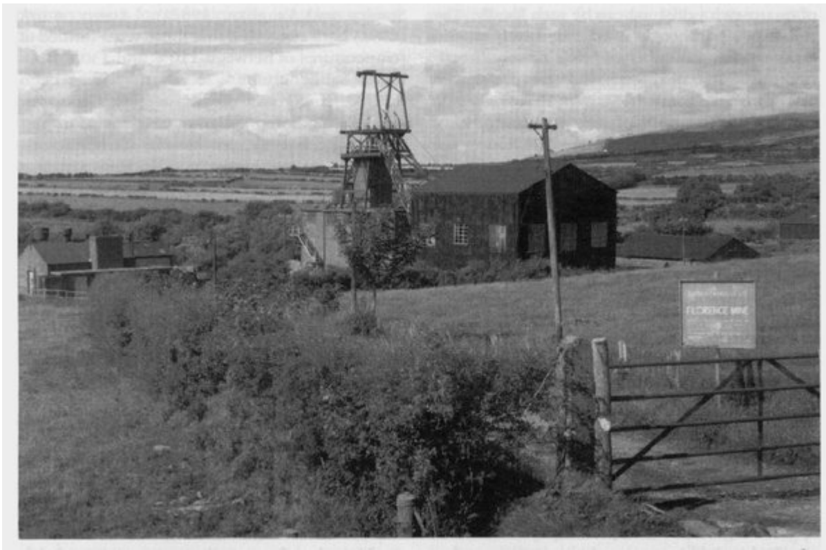
(Figure 2.21) The No. 2 Shaft headframe and buildings at Florence Mine.