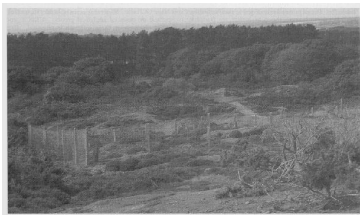
(Figure 7.53) View across the main area of spoil heaps, Penberthy Croft Mine. The fenced area is Daws Shaft, the type locality for bayldonite.