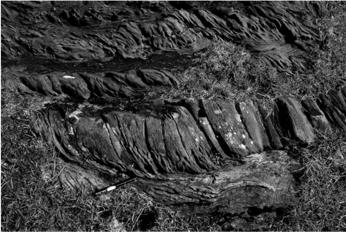
(Figure 2.17) Refracted S1 cleavage cutting near-horizontal bedding close to the hinge-zone of a mesoscopic F1 fold, in metasandstone beds, viewed to the north-east, Kinuachdrachd, Isle of Jura. Spirit level is 5 cm long.