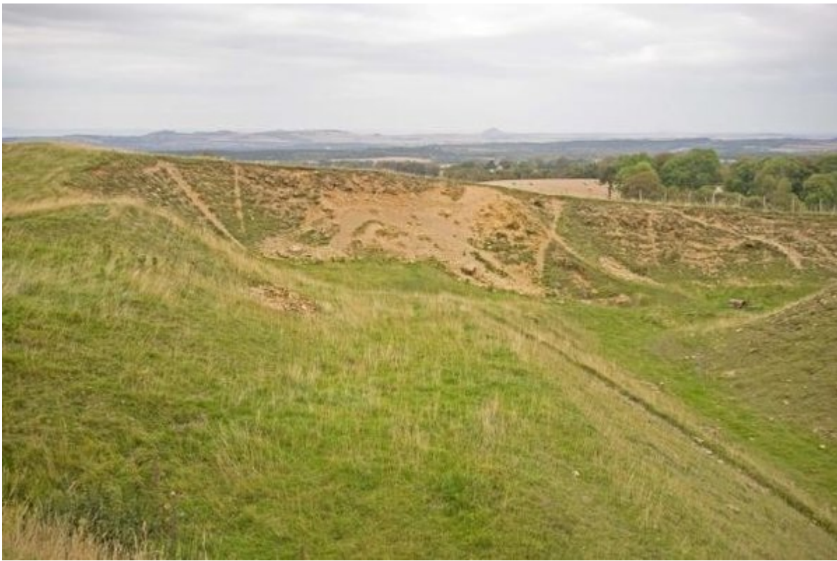
(ELC_23_P3) Disused limestone pit, Kidlaw.