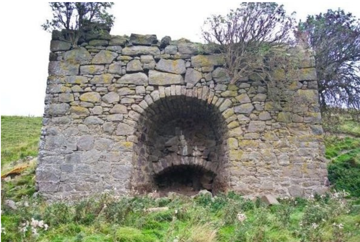
(ELC_23_P2) Disused limestone kiln, Kidlaw.