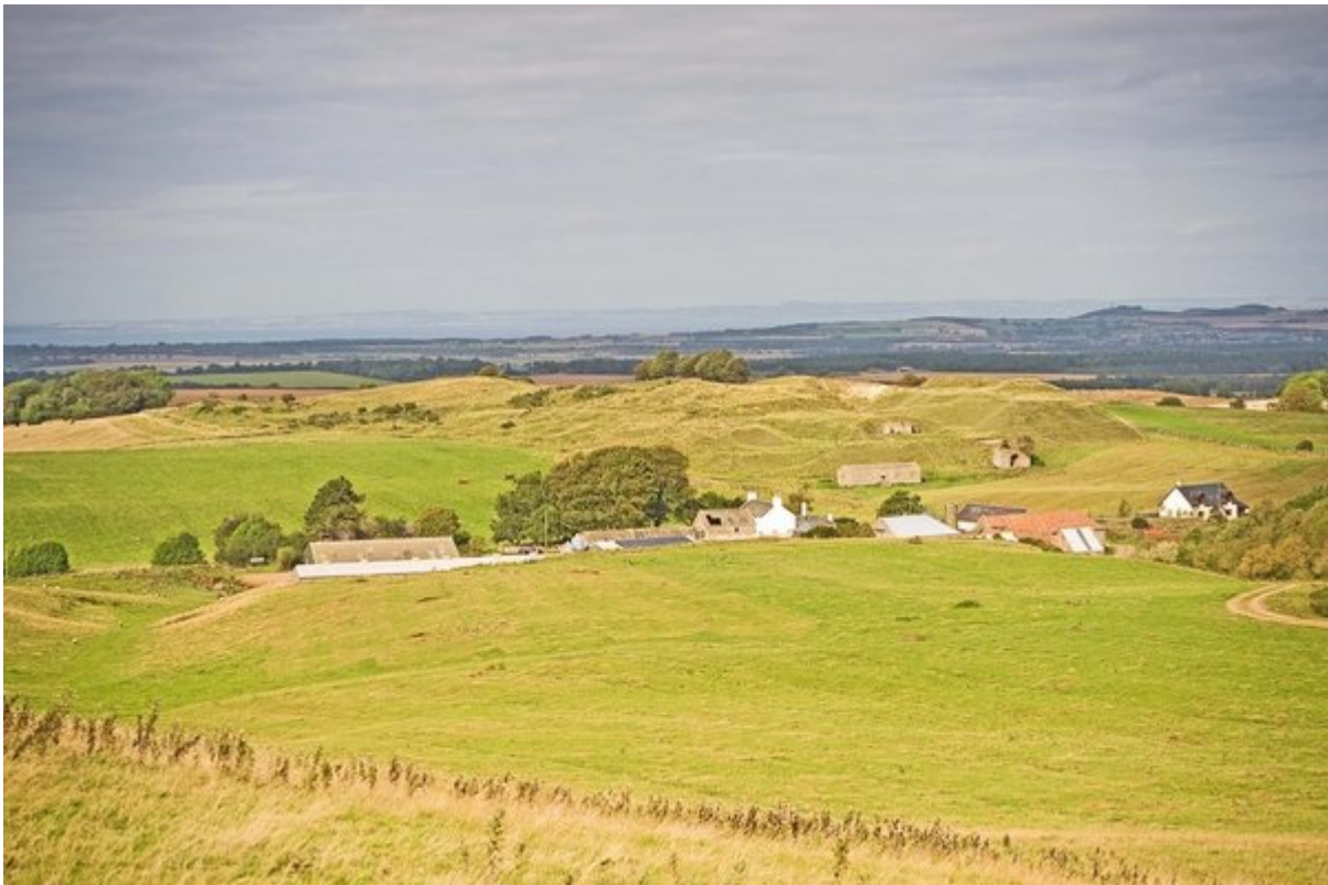
(ELC_23_P1) A glacially transported mass of mass of limestone forms a striking topographic feature north of Kidlaw Farm (centre). View from the south.