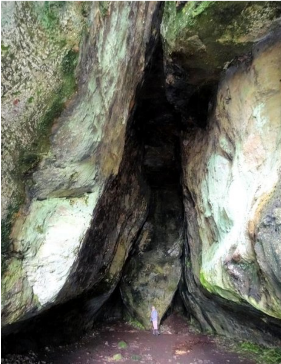
(Figure 2) King's Cave. The figure is ~1.6 m high.