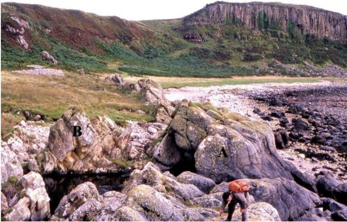
(Figure 4) View from Cleiteadh nan Sgarbh towards the Drumadoon Sill. A — felsite; B — quartz-feldspar porphyry

Geological Society of Glasgow Excursion Itineraries