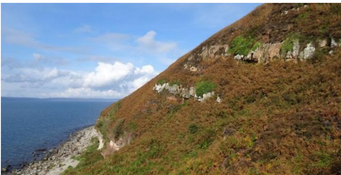
(Figure 3) View north from the path to King's Cave car park. Felsite and pitchstone sills are intruded into sandstone of the Permian Lamlash Beds a short distance south of King's Cave.