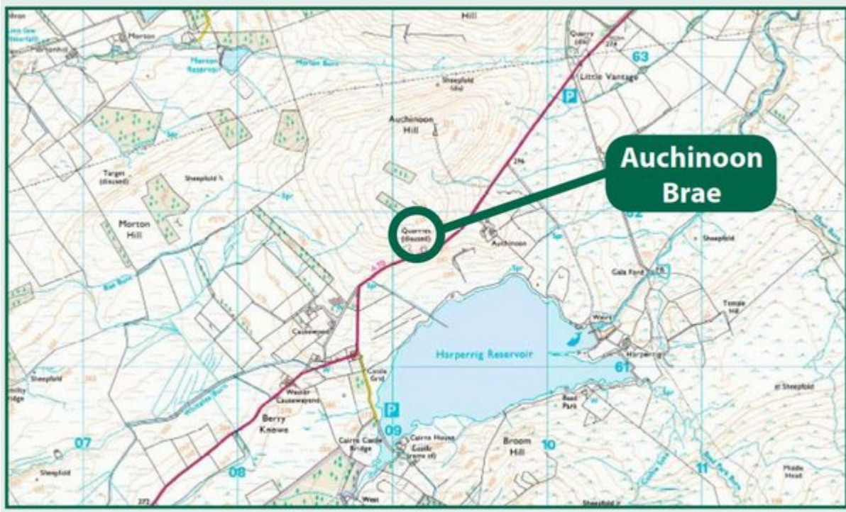
(Figure 1) Location map.