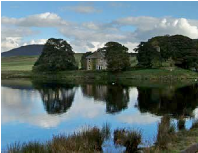
(Figure 5) Harperrig Reservoir. Cairn House and the remains of Cairn Castle in the trees.