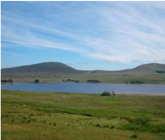
(Figure 2) Harperrig Reservoir.