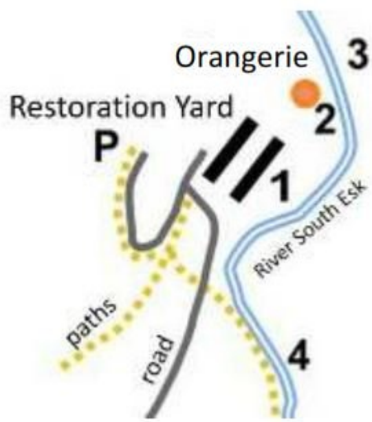
Map 1 Locations.