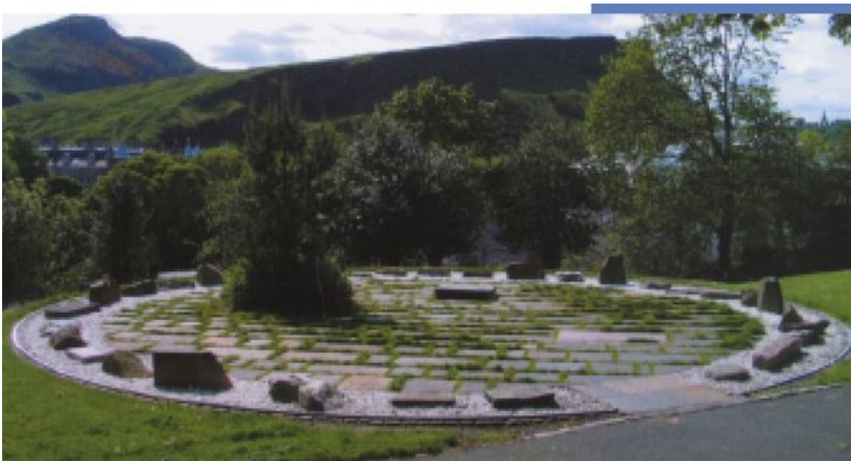
(Figure 1) Stones of Scotland.