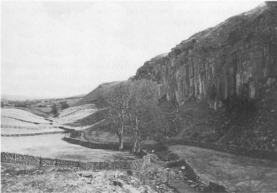
(Figure 16.4) The Whin Sill forming Howick Scars, looking east (Locality 15).