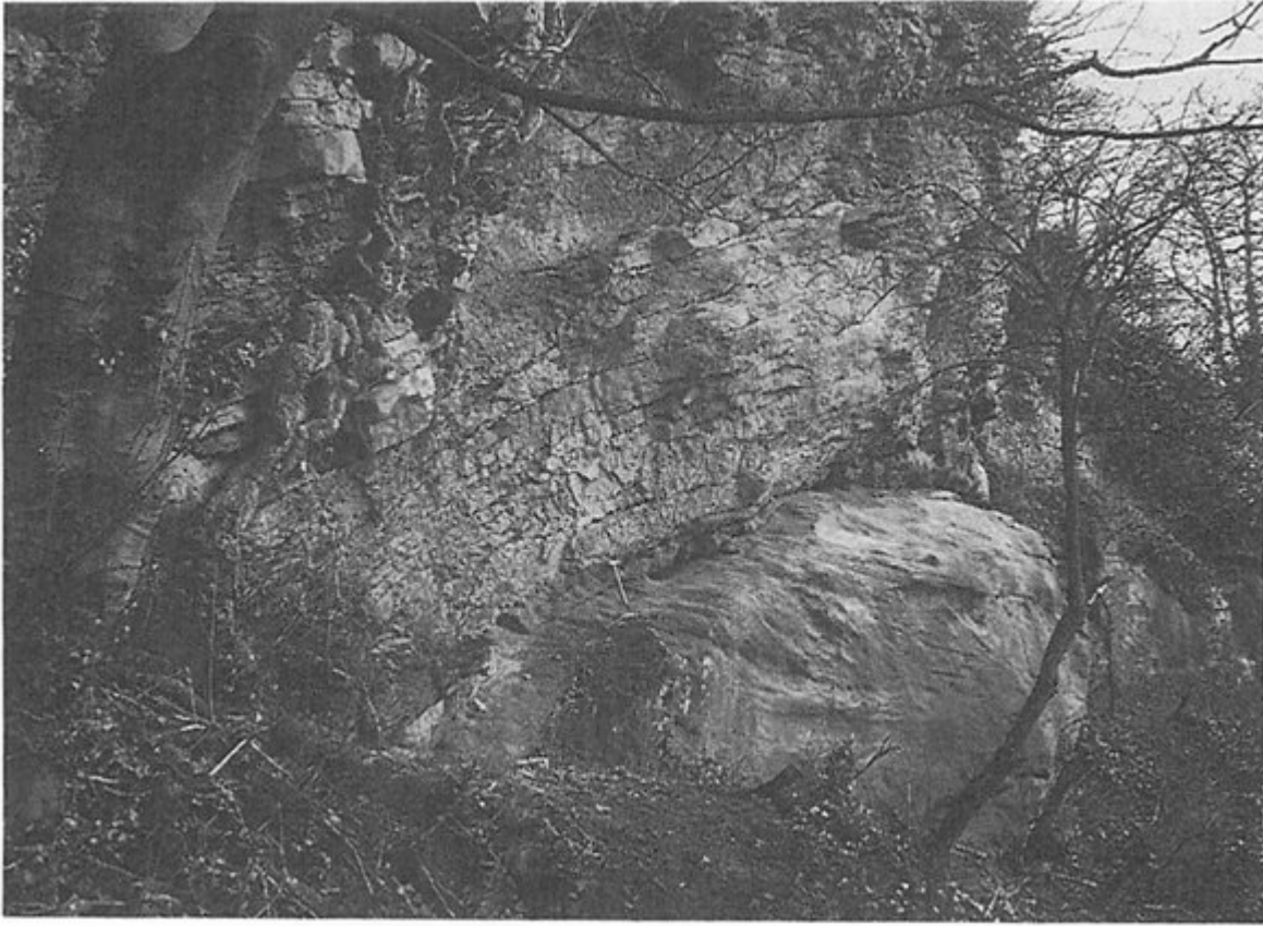
(Figure 13.2) Carboniferous-Permian unconformity at Abbey Crags (Locality 4).