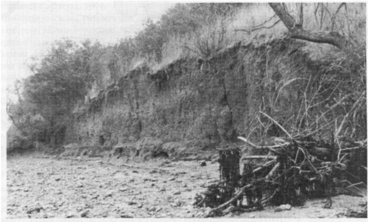
(Figure 14.11) 'The Cliff' section, looking east, soil on London Clay, Burnham-on-Crouch, (photo: S.J. Metcalf).