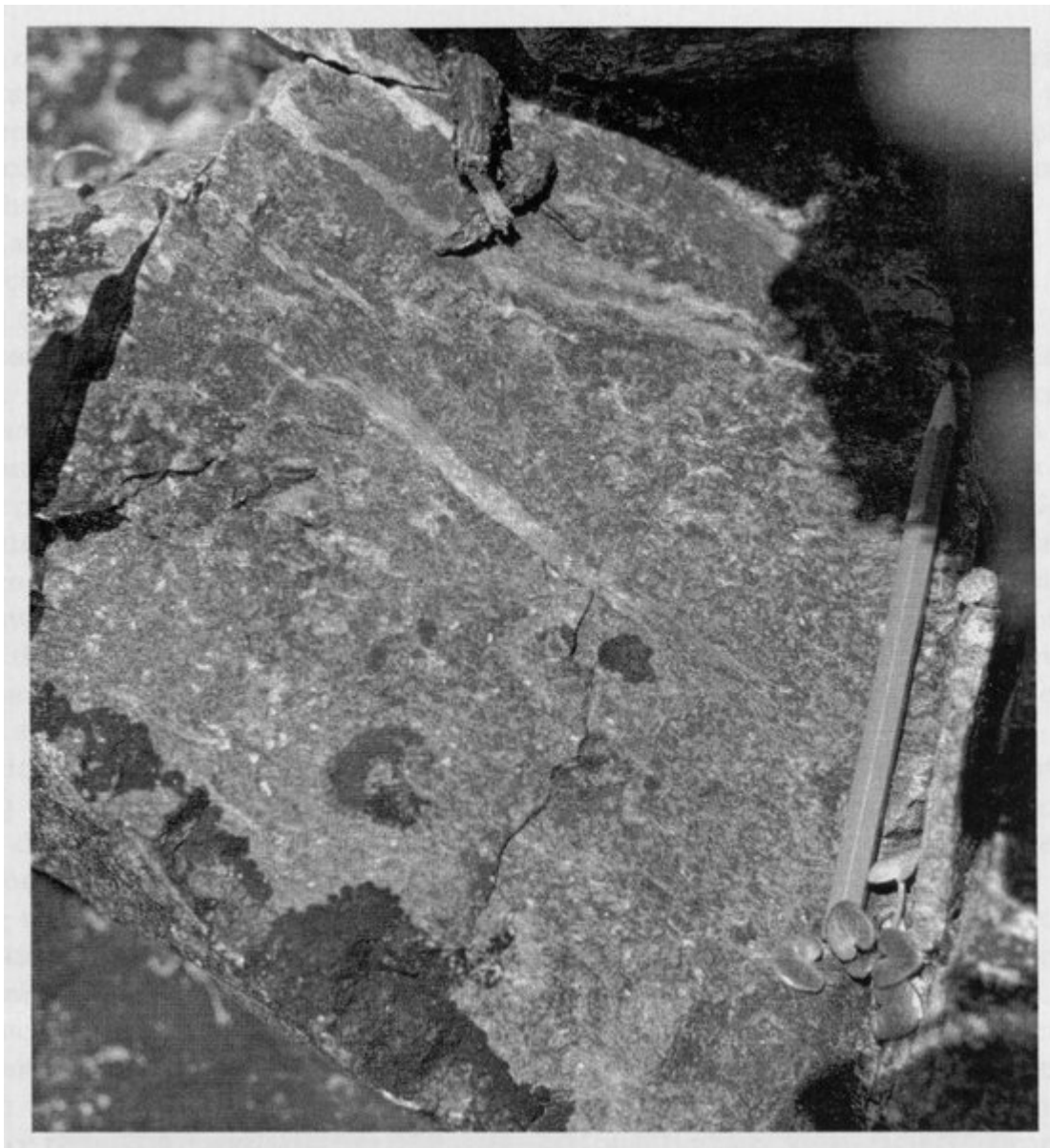
(Figure 6.15) Ragged, elongate pumice fragments up to 12 cm in length in the Cader Rhwydog Tuff, Cader Rhwydog, Ramsey Island.