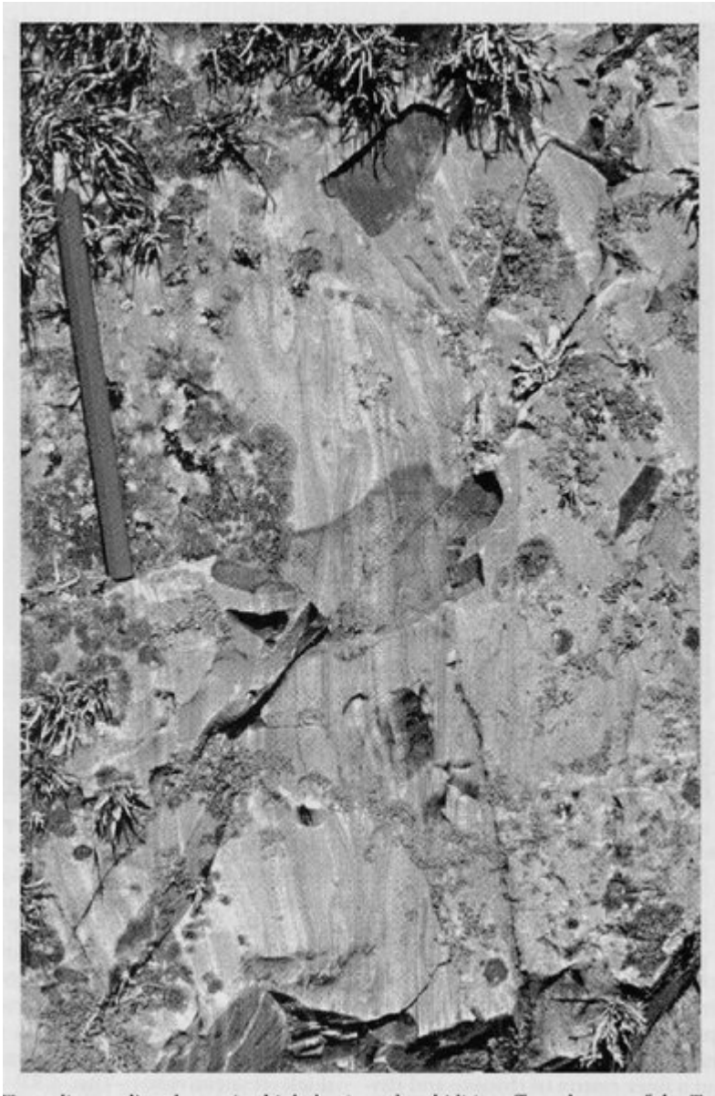
(Figure 6.16) Wet sediment disturbance in thinly laminated turbiditic tuffs at the top of the Trwyn yr Allt Tuff, Cader Rhwydog Member, Cam Llundain, Ramsey Island.