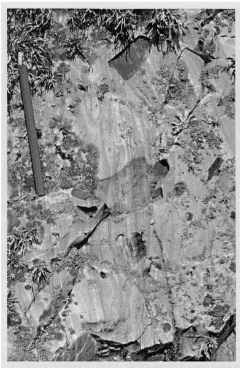
(Figure 6.16) Wet sediment disturbance in thinly laminated turbiditic tuffs at the top of the Trwyn yr Allt Tuff, Cader Rhwydog Member, Cam Llundain, Ramsey Island.