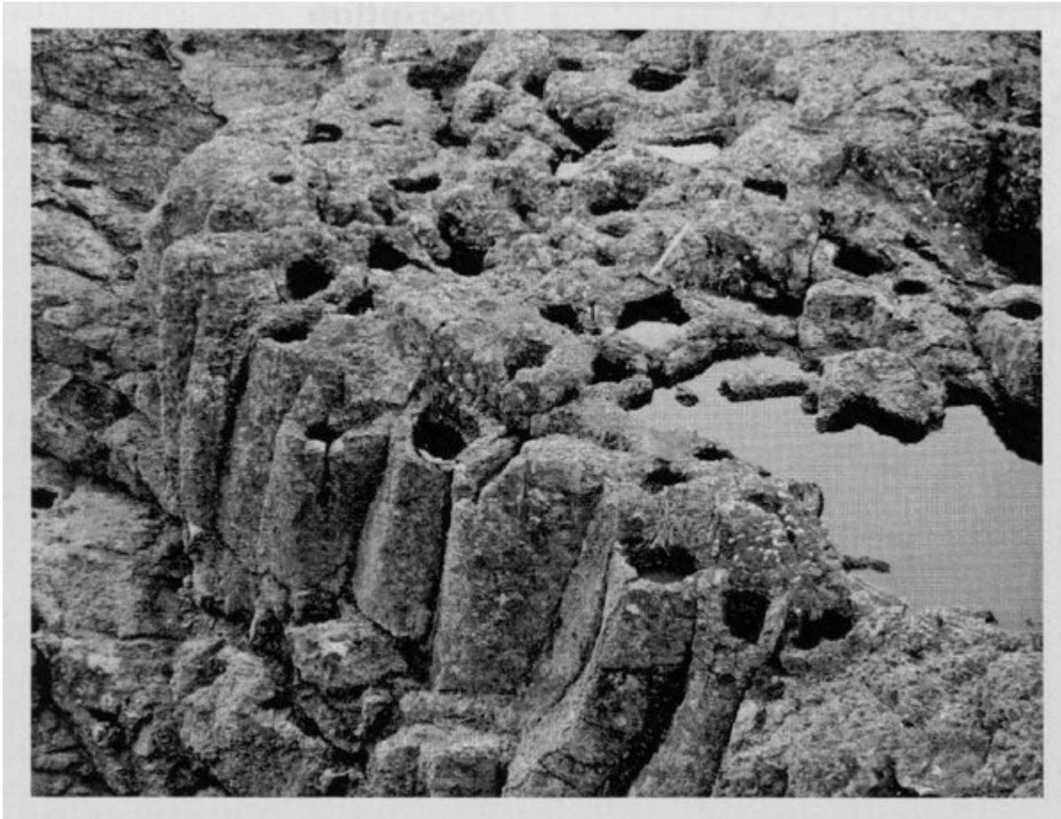
(Figure 9.20) Differential weathering in hexagonal columns of Crawton type basalt, Crawton Bay.