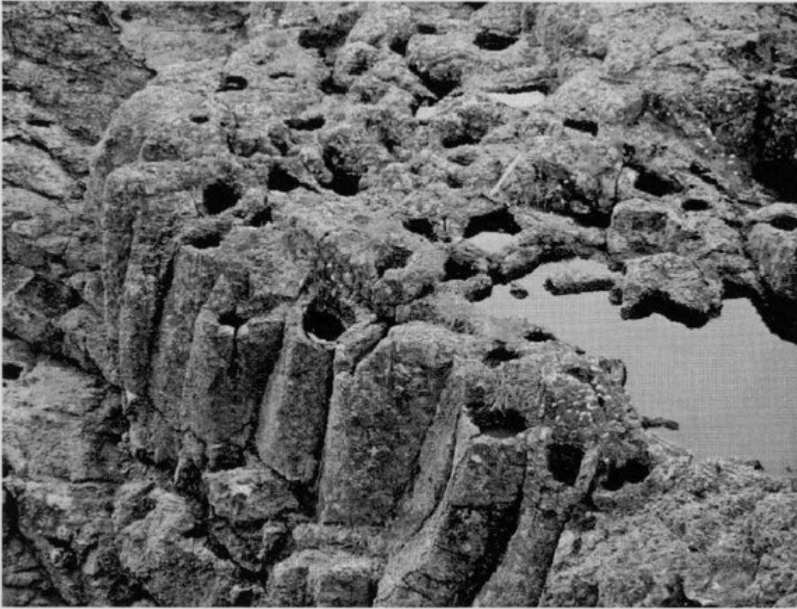
(Figure 9.20) Differential weathering in hexagonal columns of Crawton type basalt, Crawton Bay.