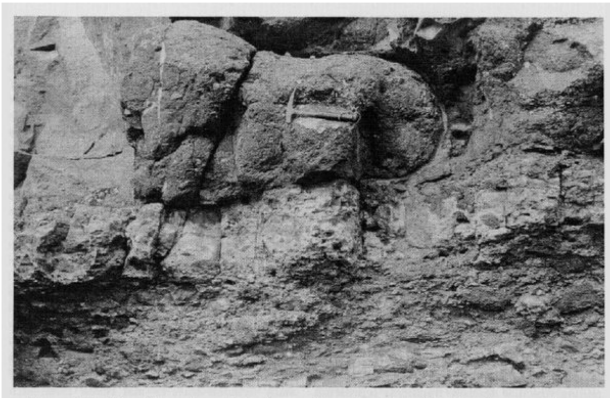
(Figure 9.37) Pillowed base of an andesite sheet overlying volcaniclastic debris flow deposit at Culzean Harbour [NS 2311 1028].