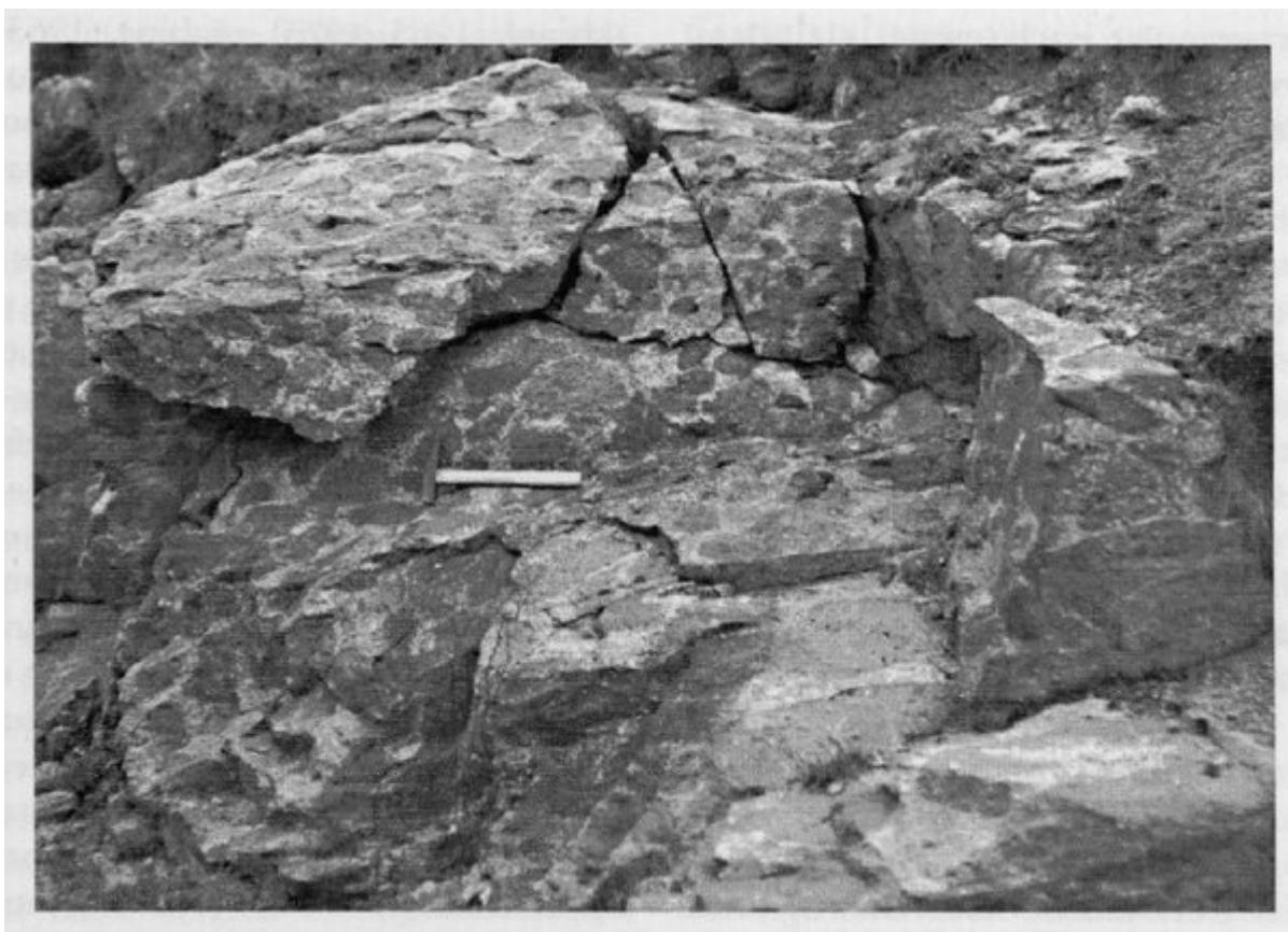
(Figure 8.9) Mafic microgranular enclaves (MME) in porphyritic biotite granodiorite of the Strontian pluton, Rubh' an Torr-mholaich, Loch Sunart [NM 8133 6015].