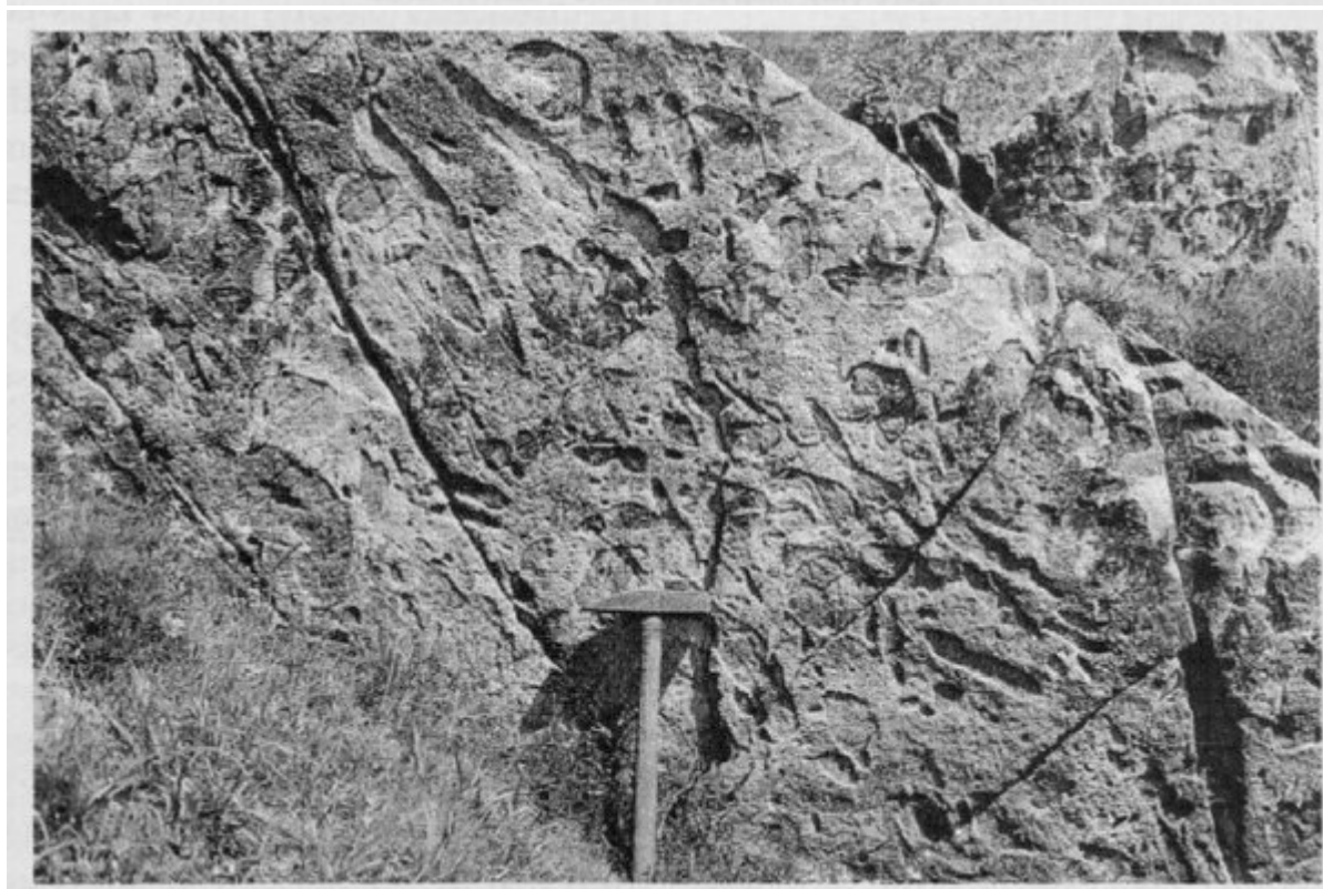
(Figure 6.27) Basic xenoliths in the margin of the Cregennen microgranite, south side of Pared y Cefn-hir [SH 6651 1506].