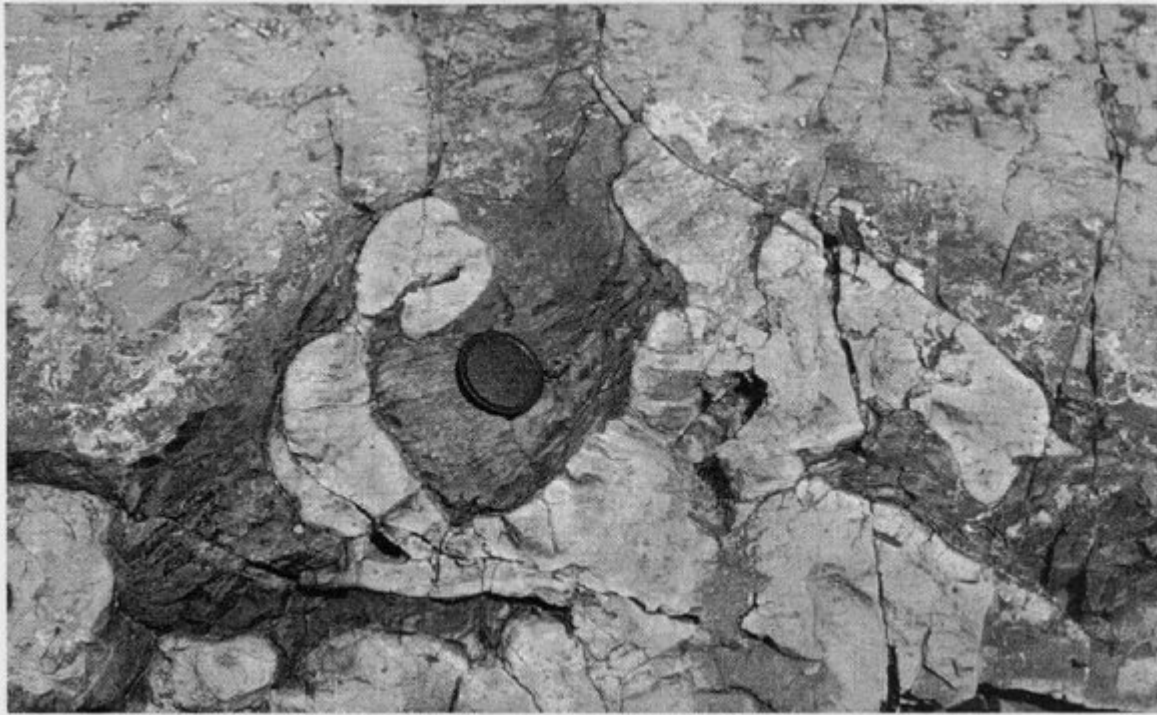
(Figure 6.13) Magma-wet sediment relationships at the base of a high-level basic intrusion, Pen Anglas. Magma has injected and loaded down into unlithified tuffaceous sediment, while the wet sediment has locally flamed up into the magma. Lens cap for scale.