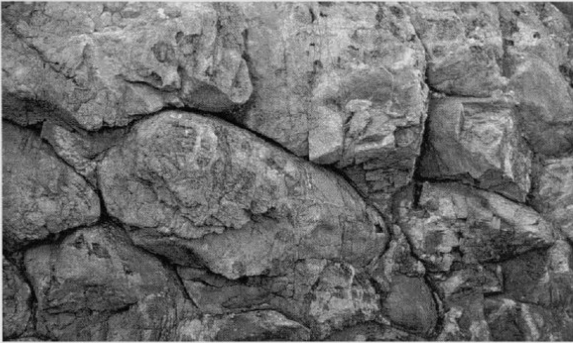
(Figure 6.11) Pillow lava from the Fishguard Volcanic Group, Strumble Head. The pillow in the centre of the photograph is 75 cm across (long axis).