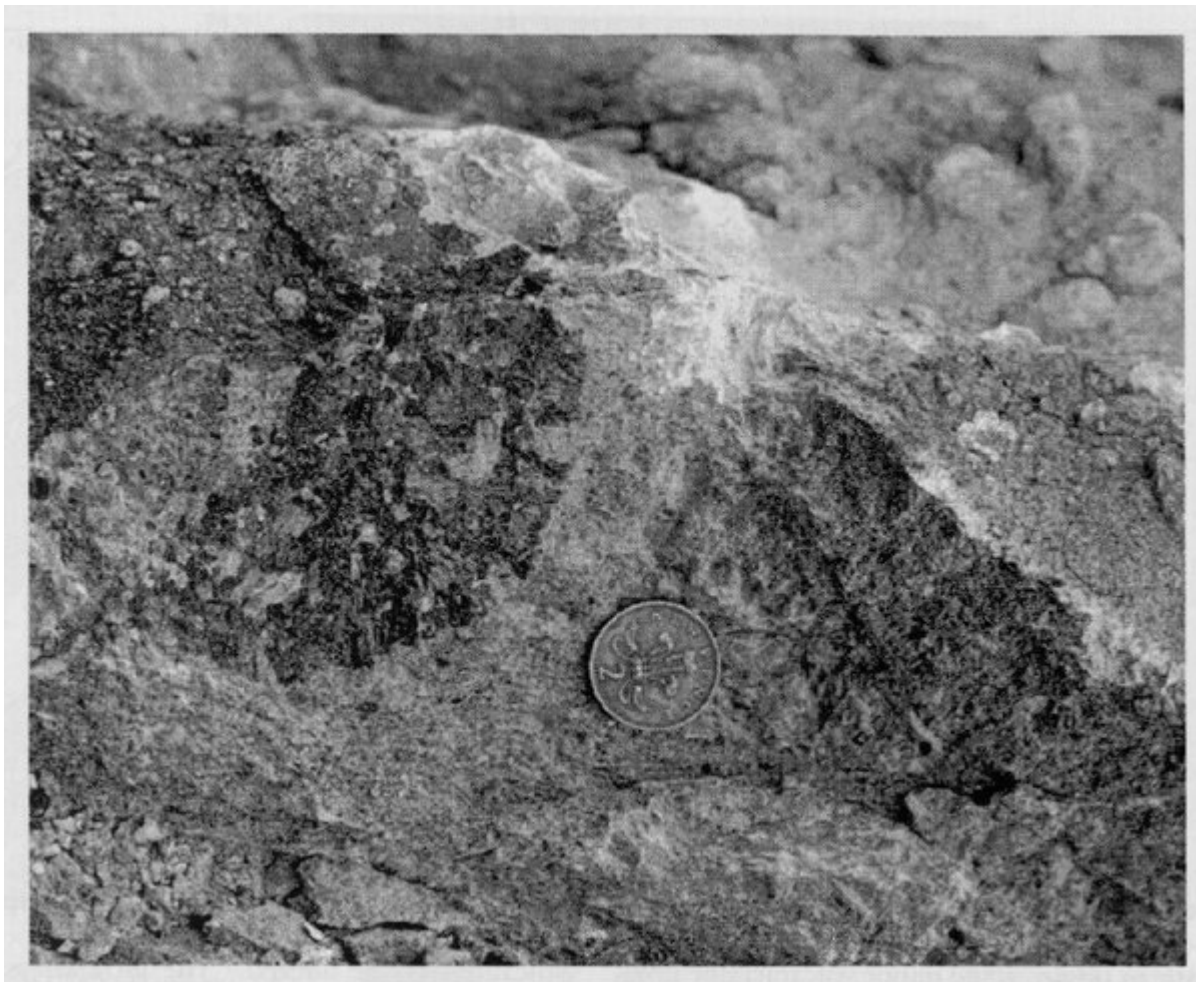
(Figure 6.9) Cognate cumulate block in basalt lava of the Rhobell Volcanic Complex, Rhobell Fawr.