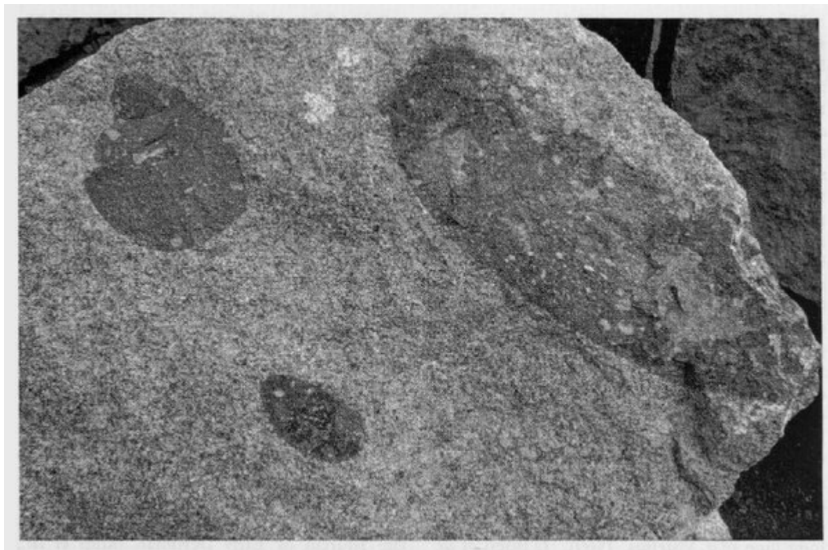
(Figure 4.45) Pink granite with xenoliths containing K-feldspar megacrysts.