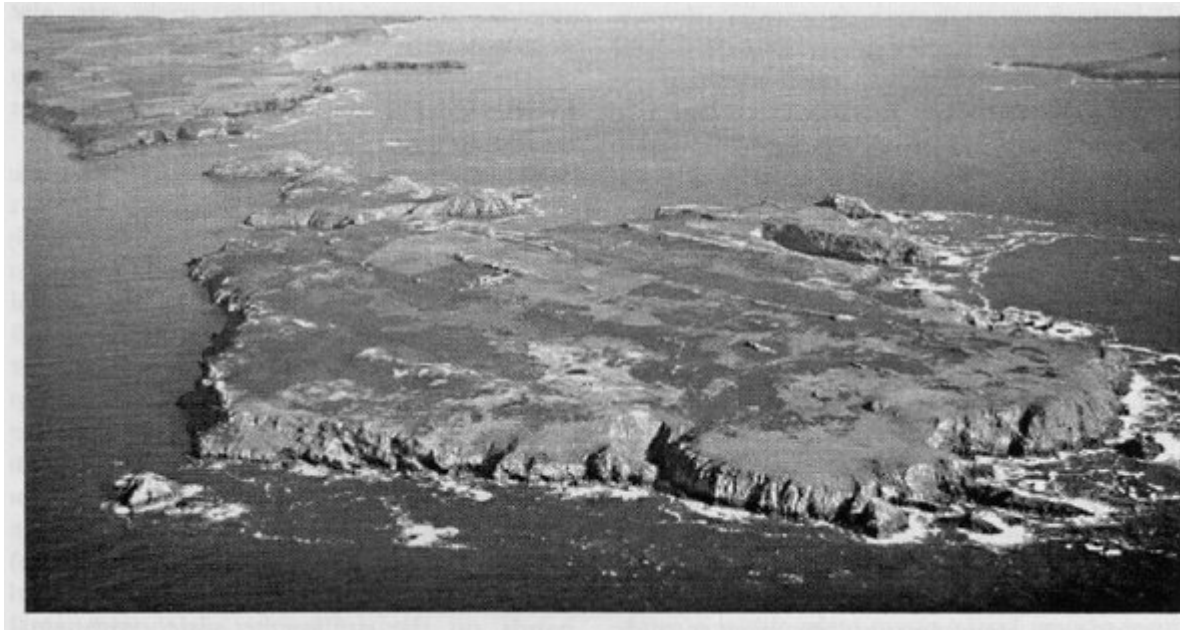
(Figure 6.70) Oblique aerial view of Skomer Island from the NW with Middleholm (Midland Island) and the Deer Park Peninsula behind. Both islands are made up chiefly of basalts, hawaiites and mugearites of the Skomer Volcanic Group.