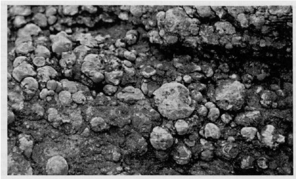
(Figure 6.71) Spherulites (up to 10 cm across) in The Basin Rhyolite, Skomer Volcanic Group, The Basin, Skomer Island.