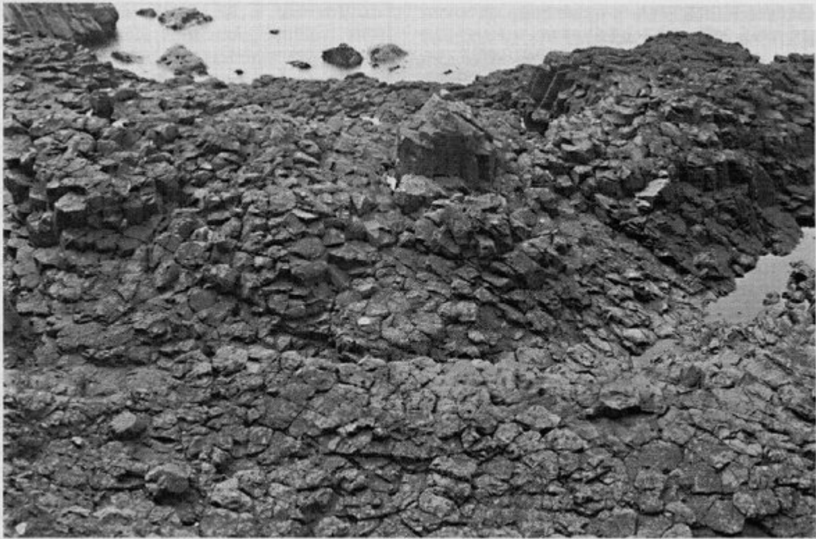
(Figure 9.5) Columnar jointing in andesite flow, south of Port Phadruig, Kerrera [NS 7888 2767].