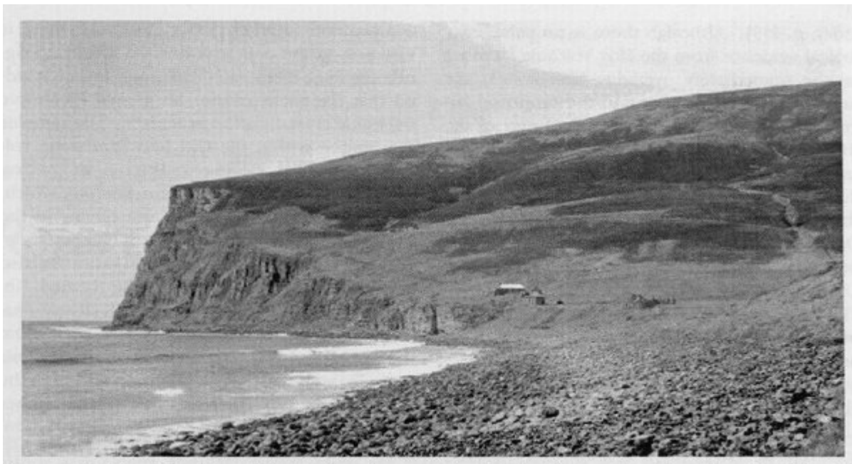
(Figure 9.53) The cliffs of Too of the Head on the west side of Rackwick Bay, Hoy. The pale rocks of the cliffs close to the buildings are composed of the Lower Eday Sandstone Formation. The lower and middle parts of the cliffs above and behind the buildings are composed of the basal volcanoclastic rocks and lava of the Hoy Volcanic Member. The paler rocks at the top of the cliff belong to the Lang Geo Sandstone Member of the Hoy Sandstone Formation.