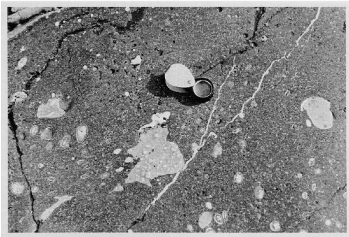
(Figure 9.39) Inclusion of vesiculated sandstone in porphyritic andesite, Port Murray [NS 2058 0792].