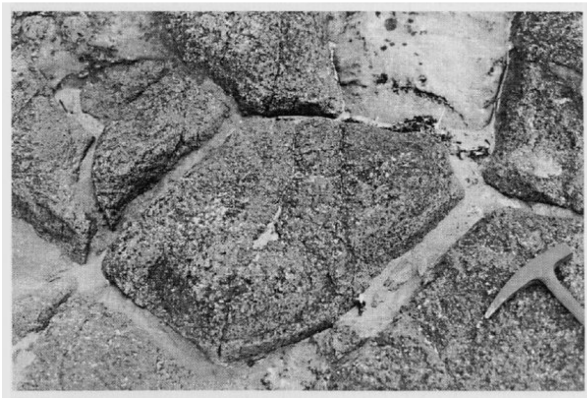
(Figure 9.40) Sandstone infilling expanded cooling joints in andesite, Port Murray [NS 2087 0810].