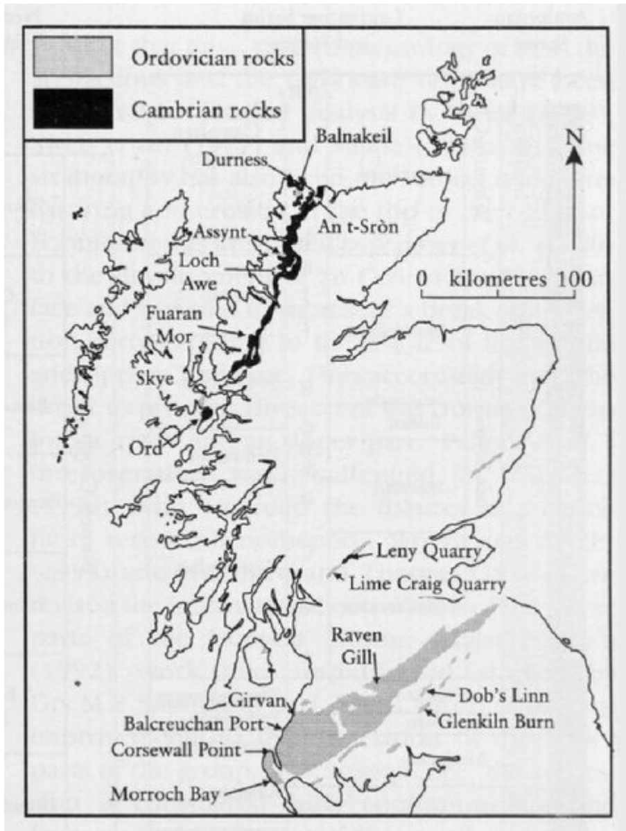
(Figure 12.1) Distribution of Cambrian and Ordovician rocks in Scotland, showing the general location of key sites.