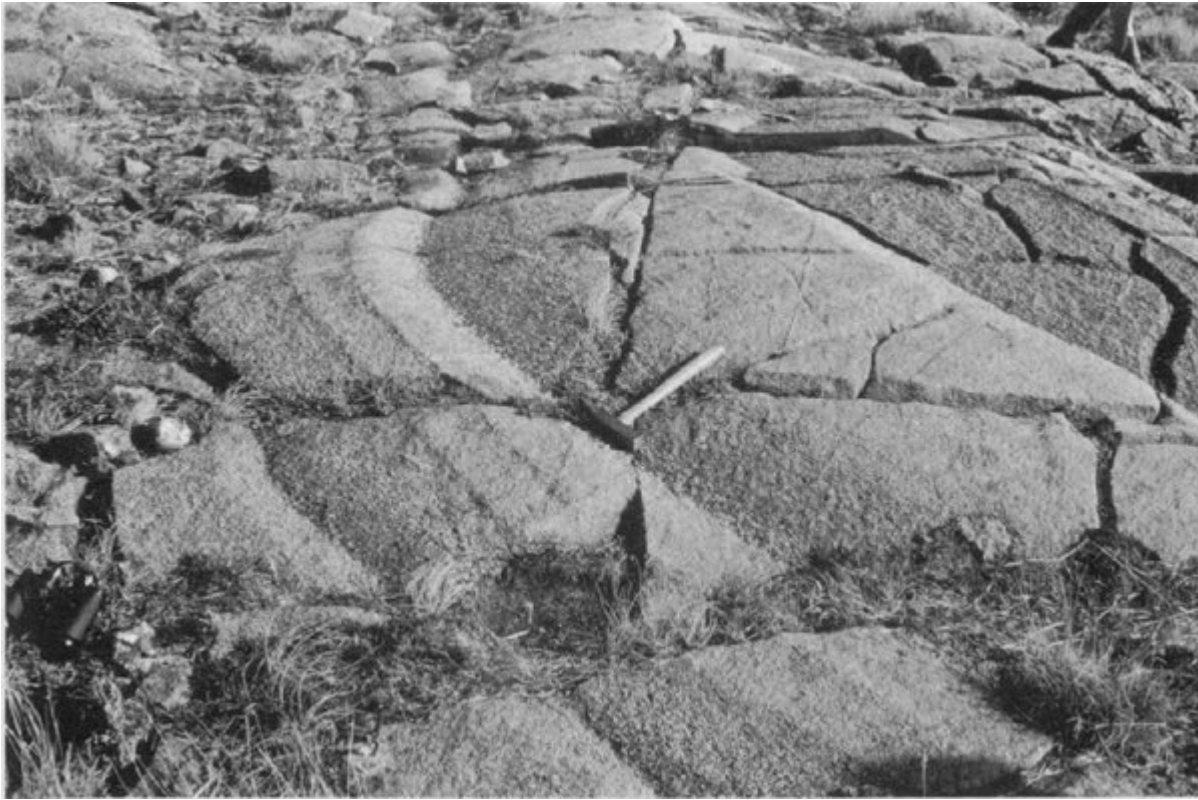
(Figure 3.14) Gravity stratified rhythmic layering in allivalite, west of Long Loch, Rum.