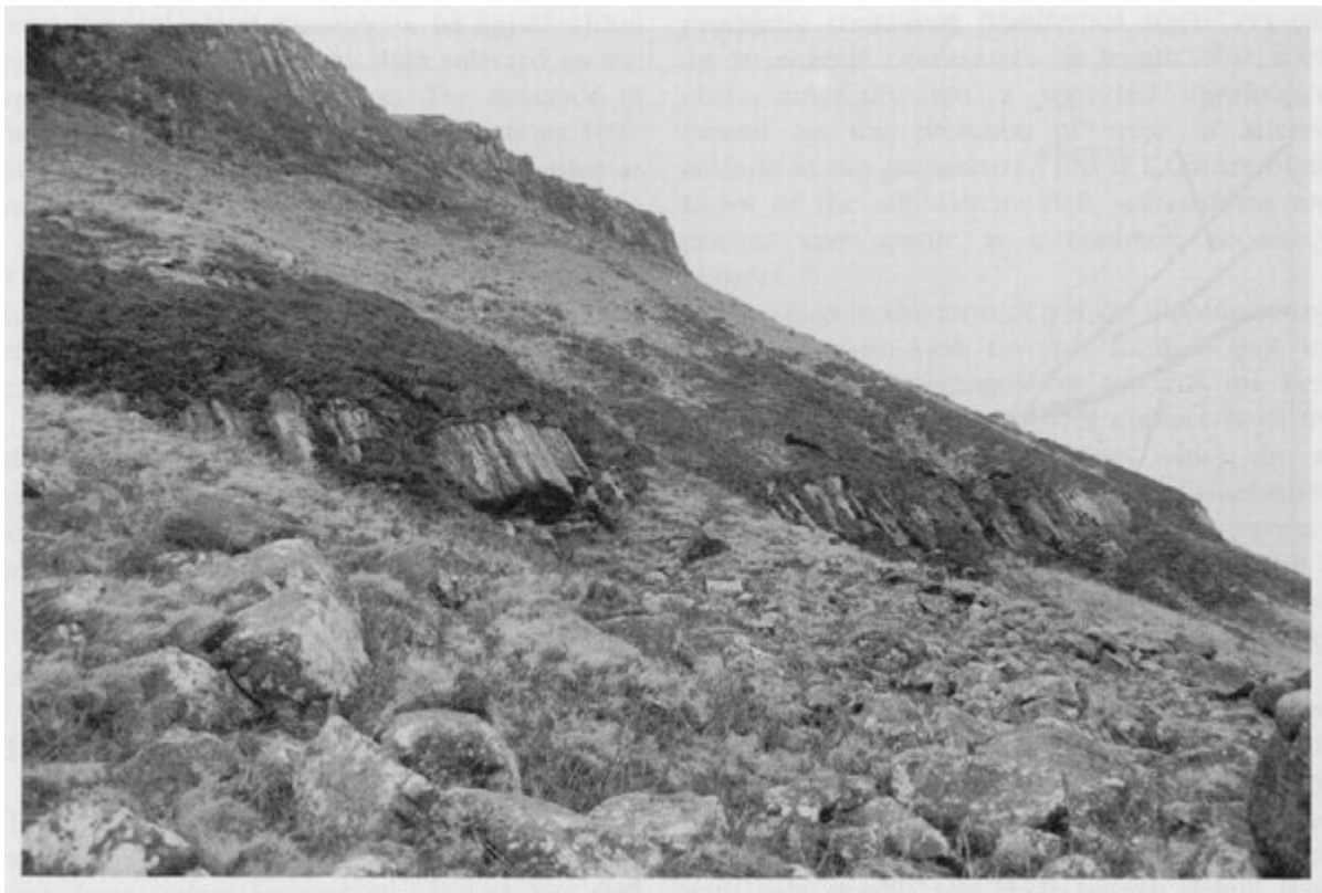
(Figure 6.11) The Corrygills pitchstone sill in the cliff below the Clauchlands Sill (crinanite) at [NS 050 337]. Corrygills Shore site, Arran.