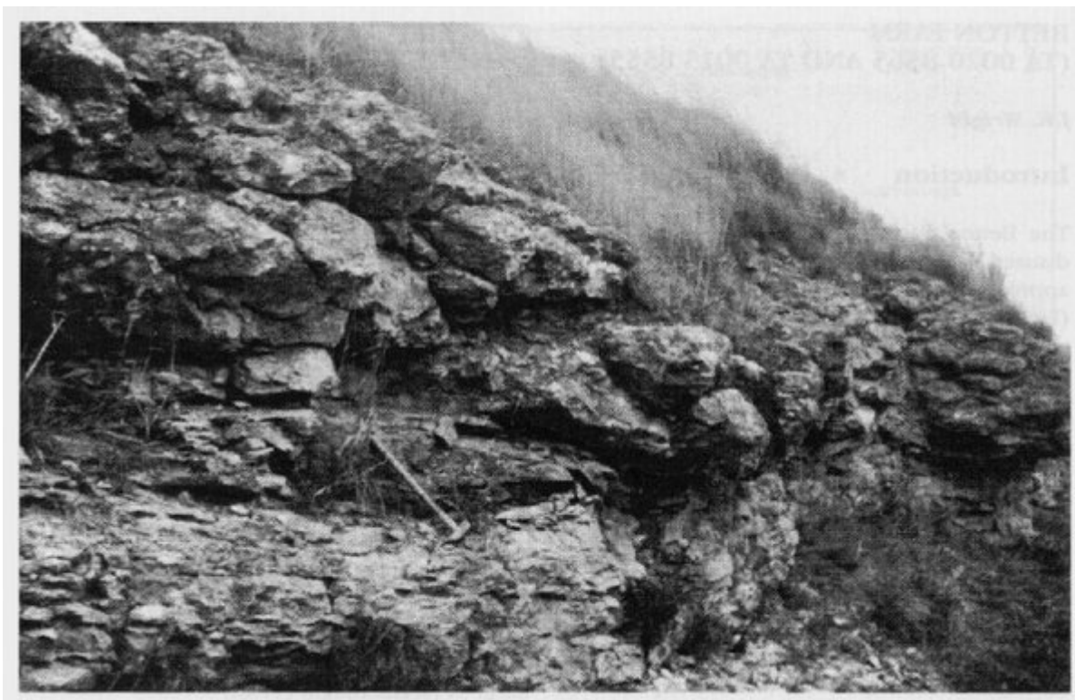
(Figure 4.21) View of Betton Farm Quarry (north) showing rounded masses of Thamnasterian reef coral above the hammer (30 cm) resting on oolite (Mahon Oolite).