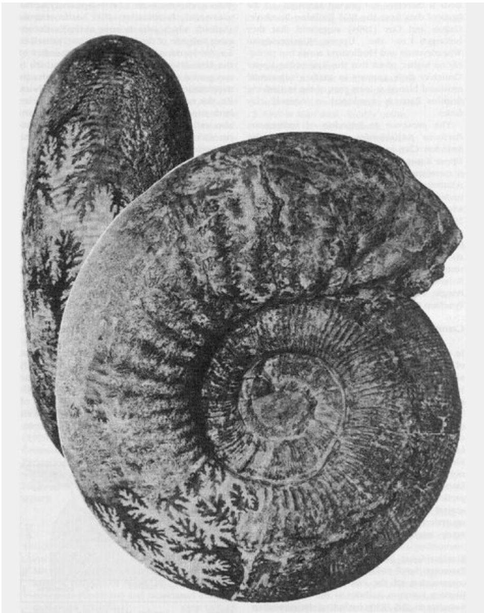
(Figure 2.36) The type specimen of Pectinatites ( P. ) eastlecottensis (Salfeld) as figured by Salfeld (1913) but enlarged to natural size.