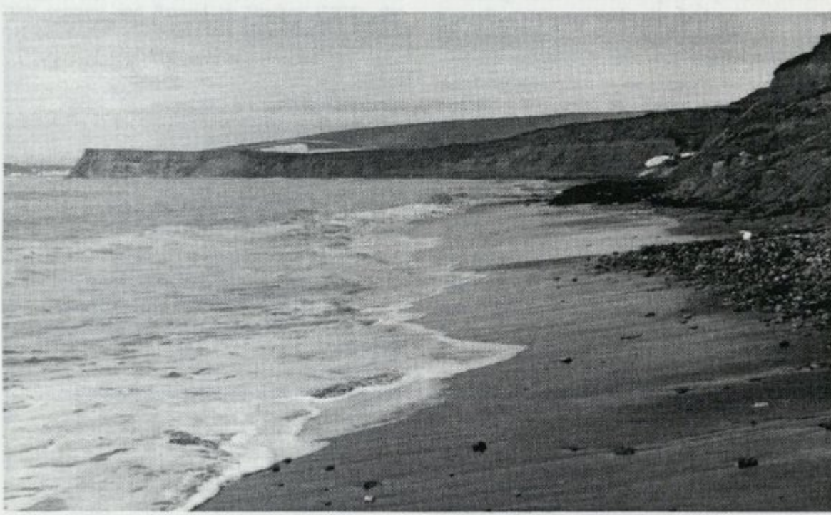
(Figure 6.11) Hanover Point from Roughland Cliff. The beds of the Wessex Formation are exposed in the cliffs of Brook Bay running south-eastwards from Hanover Point (left). The darker upper layer in the cliff consists of unconformable Quaternary deposits.