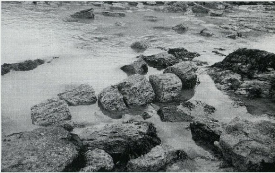
(Figure 6.13) The Pine Raft at Hanover Point, Isle of Wight. These massive petrified logs, exposed at low tide, are mineralized in carbonate and lie in sandstone. They have tracheid pitting similar in character to the better-preserved cheirolepidiaceae woods of Pseudofrenelopsis parceramosa (Fontaine) Watson found at Shippards Chine but the arrangement of these is more araucarioid. They are better classified in the form-genus Dadoxylon.