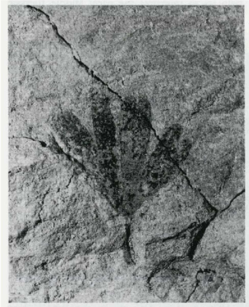
(Figure 3.20) Ginkgo whitbiensis Harris. A characteristically small leaf with blunt apices to its lobes. Its veins are obscure. Laboratory of Palaeobotany and Palynology, Utrecht, specimen S.1468, Saltwick Formation, Roseberry Topping, \times 2 . (From van Konijnenburg-van Cittert and Morgans, 1999)

Konijnenburg-van Cittert (1973), Spicer and Hill (1979), van Konijnenburg-van Cittert (1971, 1975a,b, 1978, 1981, 1987, 1989), and van Konijnenburg-van Cittert and Morgans (1999), from archived field notes in the Natural History Museum (London), and from examining collections in that museum and the National Museum and Gallery Cardiff. Records known to fall outside the boundaries of the sites have been omitted, but those over which there is some doubt have been included.