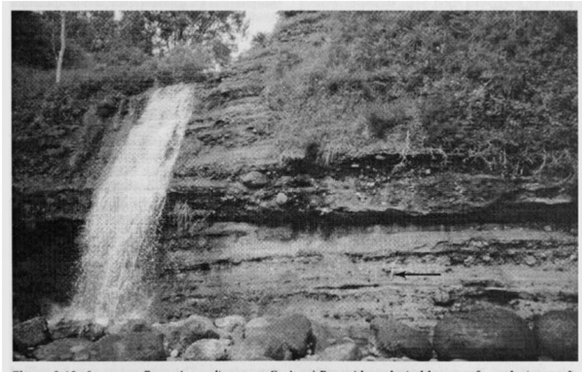
(Figure 3.10) Stornoway Formation sediments at Gruinard Bay, with geological hammer for scale (arrowed).