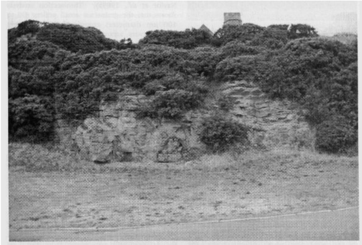
(Figure 3.5) Lossiemouth East Quarry, showing water-laid Burghead Sandstone Formation at the base, and large aeolian cross-bedded sandstone sets in the Lossiemouth Sandstone Formation above. The face is about 9 m high.