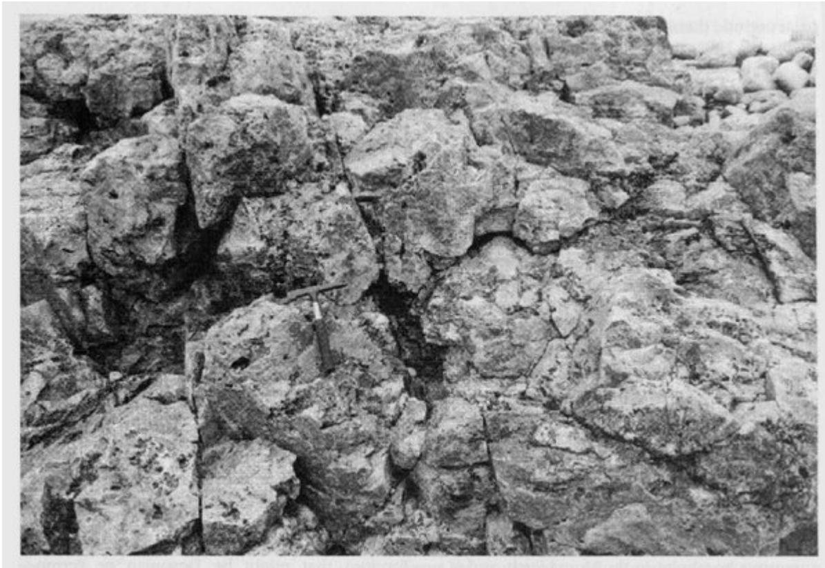
(Figure 3.7) The Cherty Rock on the foreshore north of Lossiemouth, a close-up showing its fractured nature.