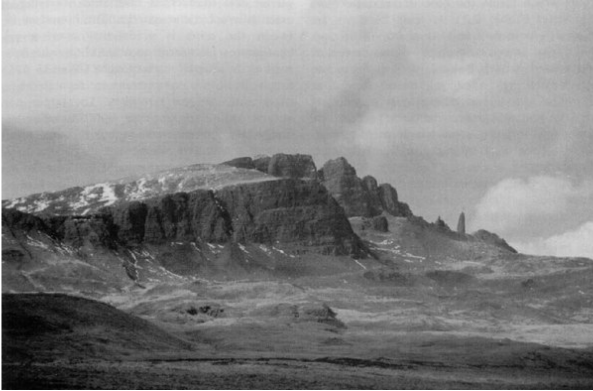
(Figure 2.5) Basalt lavas of the Skye Main Lava Series. Slipped masses of lava, including the Old Man of Storr pinnacle, occur in the foreground and to the right. Storr site, Skye.

(Table 2.2) Correlation of the divisions of the Palaeocene lavas of the Isle of Skye (mainly after Williamson, 1979, table 1).