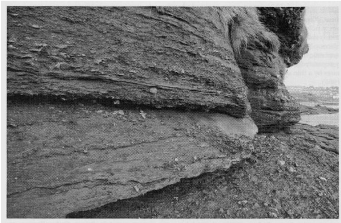
(Figure 2.33) The Tor Bay Breccia in Saltern Cove.