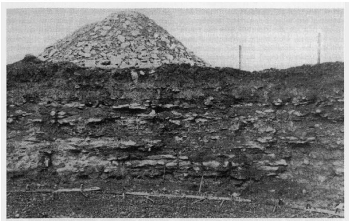
(Figure 2.25) The main face at Troll Quarry, as exposed in 1964.