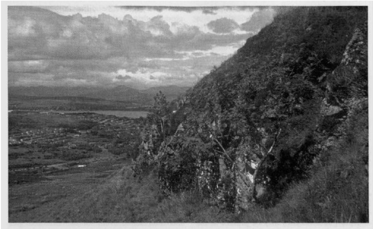
(Figure 2.34) View from the north-west flank of Cauldron Hill, towards Gourock and the River Clyde. The low crag is typical of the composite hawaiitic lavas in the Dunrod Hill GCR site.