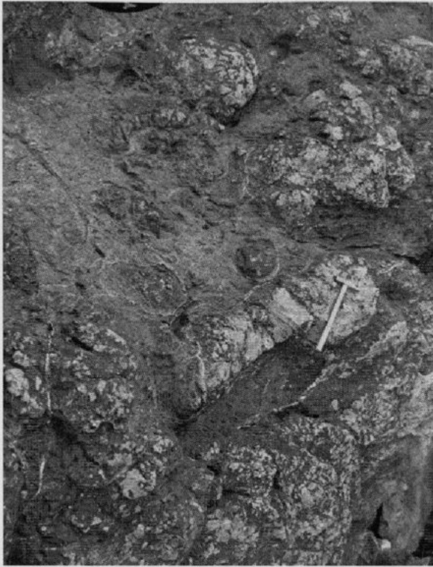
(Figure 7.21) Basaltic pillow lava at the Spring Cove GCR site with clasts of altered limestone and numerous calcite veins [ST 309 625]. The hammer shaft is about 35 cm long.