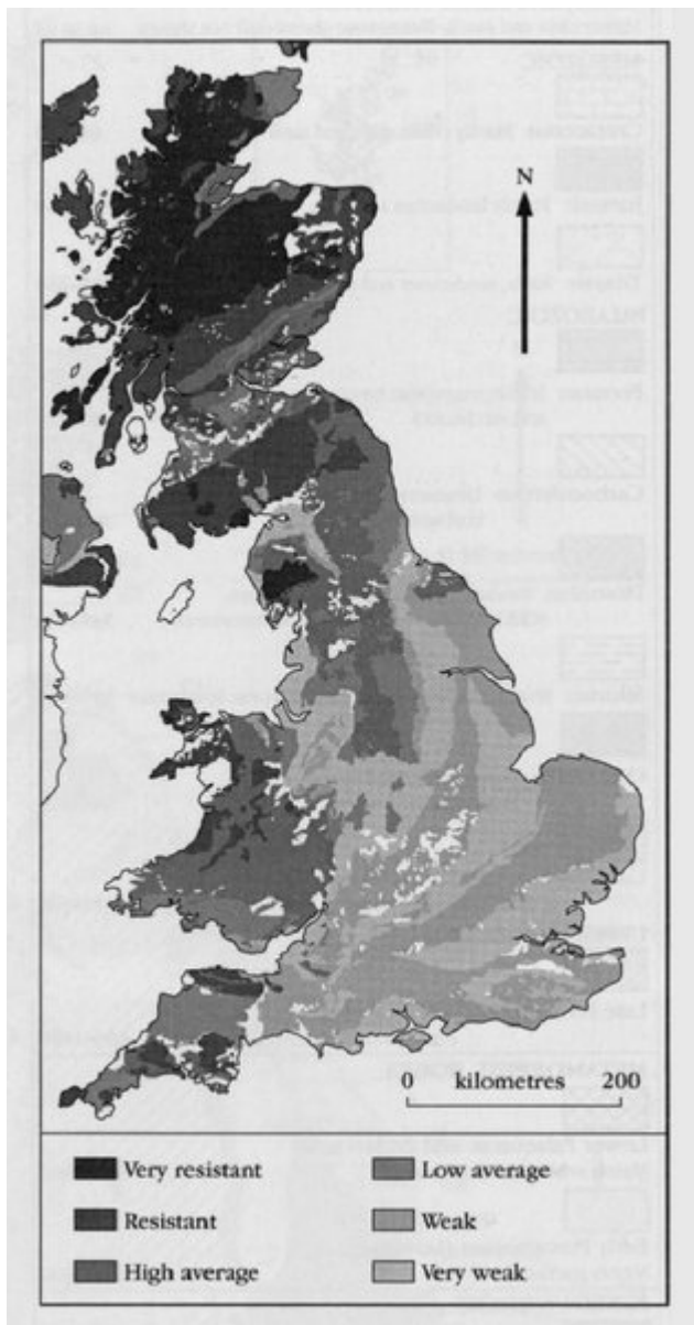
(Figure 1.3) Relative rock resistance for 71 different outcrops (divided by lithology and age) was established through computer analysis of data on altitude, dissection, and geology for a grid of kilometre squares covering Great Britain and the surrounding continental shelf. Six consistent classes were established using up to 19 variables in various combinations. White areas are unclassified. (From Clayton and Shamoon, 1998, fig. 1).