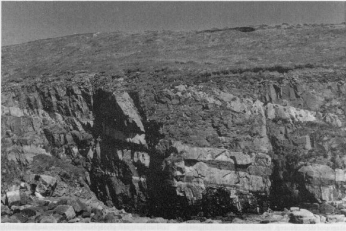
(Figure 5.18) Pegmatite—aplite—granite sheets cutting Mylor Slate Formation metasediments in the cliffs at Legereath Zawn, near Tremearne Par. Megiliggarr Rocks, Cornwall.