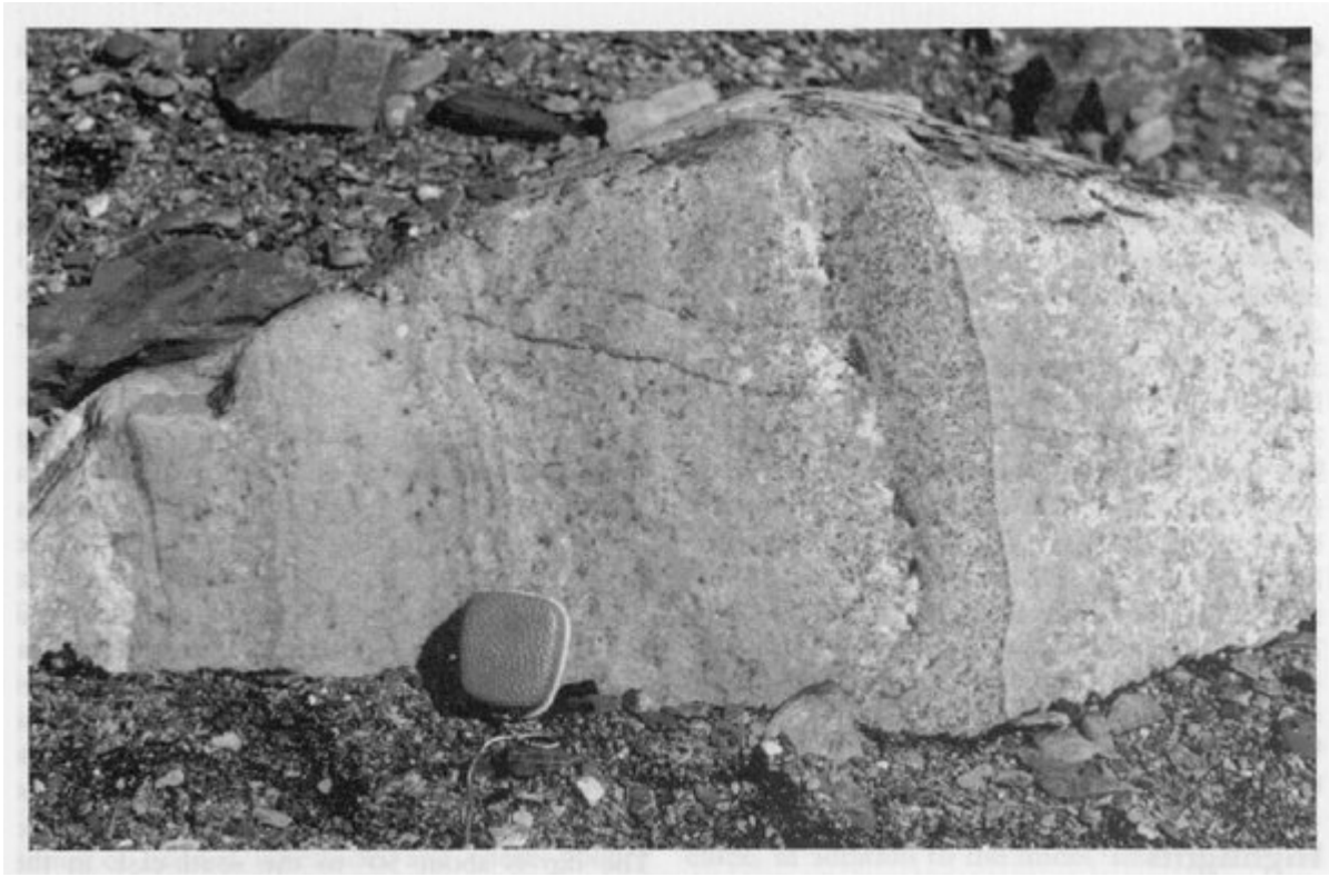
(Figure 5.20) Pegmatite—aplite—granite boulder on Tremearne Beach, demonstrating the quasi-sedimentary character of the igneous layering. Megiliggarr Rocks, Cornwall.