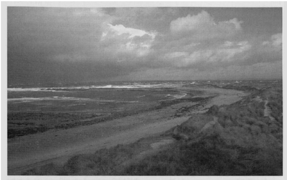
(Figure 11.26) Coves Haven, on the northern coast of Holy Island. The underlying Carboniferous Limestone is covered by till and emerged beach sediments, which are covered by dunes aligned from north-west to south-east.