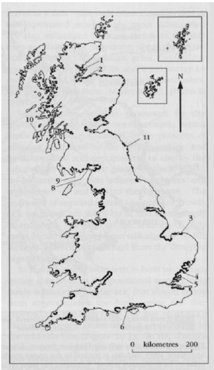
(Figure 10.1) The generalized distribution of active saltmarshes in Great Britain. Key to GCR sites described in the present chapter or Chapter 11 (coastal assemblage GCR sites): 1. Morrich More; 2. Culbin; 3. North Norfolk Coast; 4. St Osyth Marsh; 5. Dengie Marsh; 6. Keyhaven Marsh, Hurst Castle; 7. Burly Inlet, Carmarthen Bay; 8. Solway Firth, North and South shores; 9. Solway Firth, Cree Estuary; 10. Loch Gruinart, Islay, 11. Holy Island. (After Pye and French, 1993.)