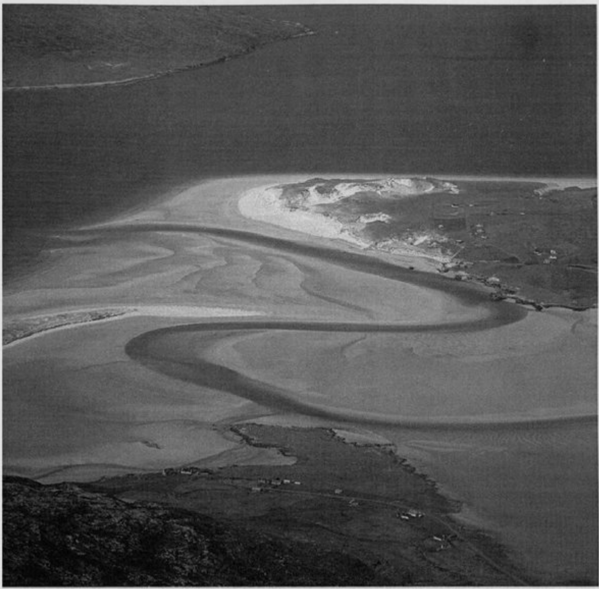
(Figure 9.15) The rocky peninsula of Crago lies in the foreground of this aerial oblique looking north-west over Tràigh Lusentyre to the dunes and machair beyond. The western tip is highly active with clear evidence of extensive wind-blow. The free-standing spit of the tip of Corran Seilebost is also in view in the centre left. The island of Taransay (at the top) provides shelter from westerly waves.