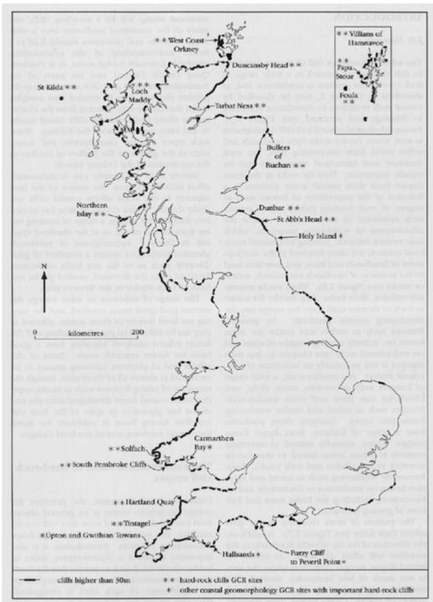
(Figure 3.1) High-cliffed coast of Great Britain, showing the location of the sites selected for the GCR specifically for coastal geomorphology features of hard-rock cliffs. Other coastal geomorphology GCR sites that include hard-rock cliffs in the assemblage are also indicated.