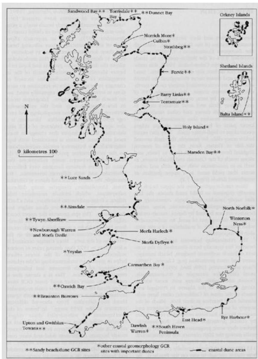
(Figure 7.1) Great Britain sandy beaches and coastal dunes, also indicating the location of GCR machair–dune sites (see chapter 9) and other coastal geomorphology GCR sites that contain dunes in the assemblage.