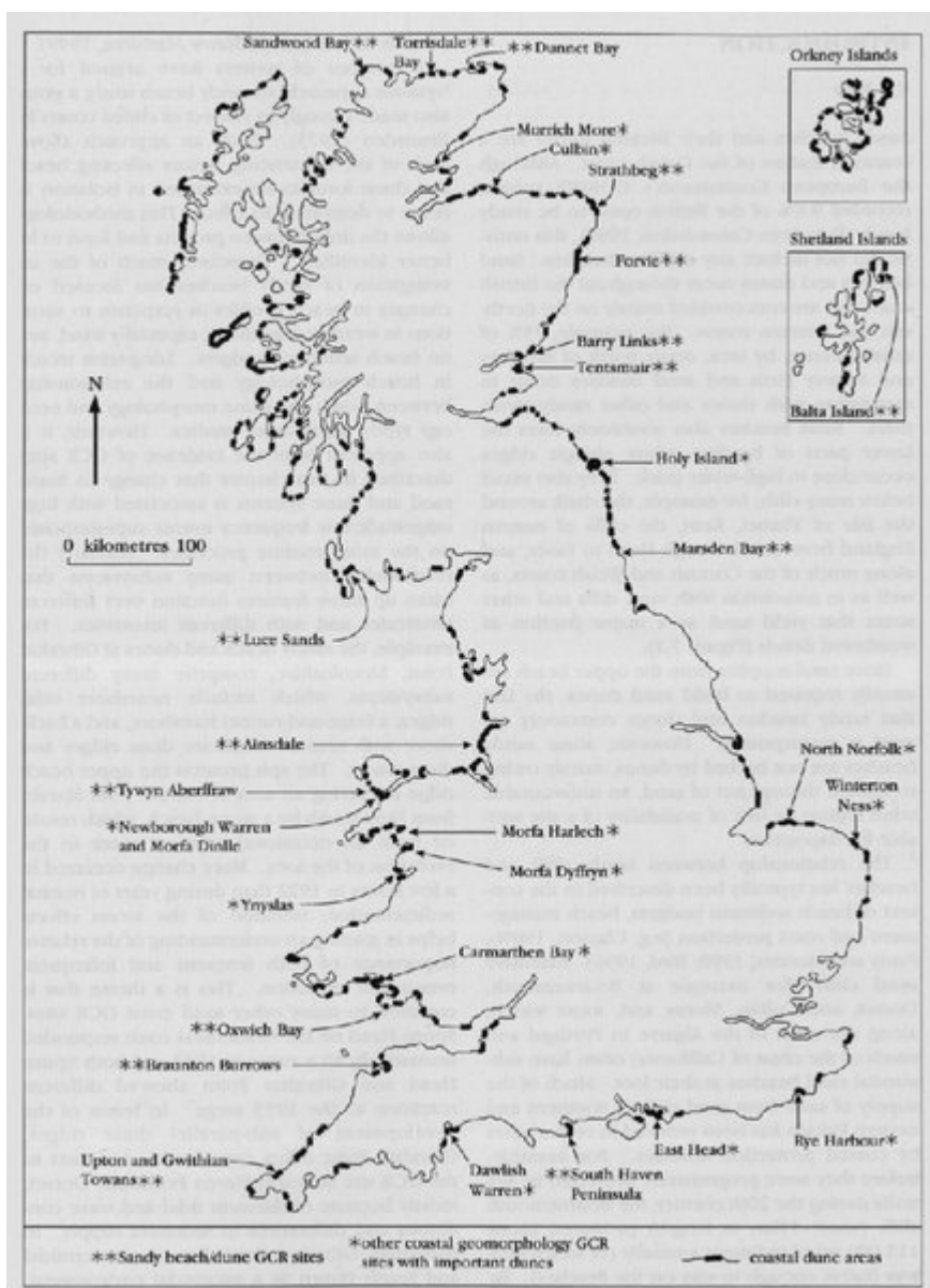
(Figure 7.1) Great Britain sandy beaches and coastal dunes, also indicating the location of GCR machair–dune sites (see chapter 9) and other coastal geomorphology GCR sites that contain dunes in the assemblage.