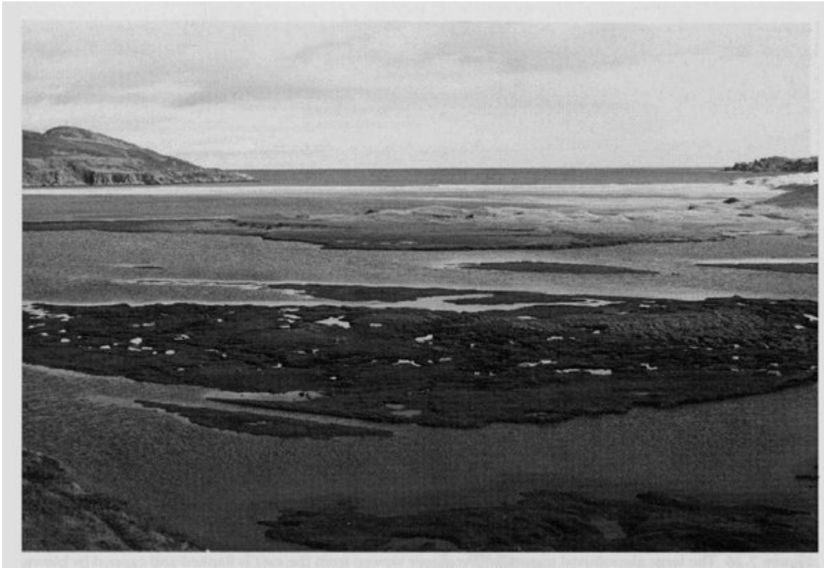
(Figure 7.27) The intertidal saltmarsh and sandflats of the River Borgie exit looking north-west over the low dune area and beach of Torrisdale Bay in the middle distance.