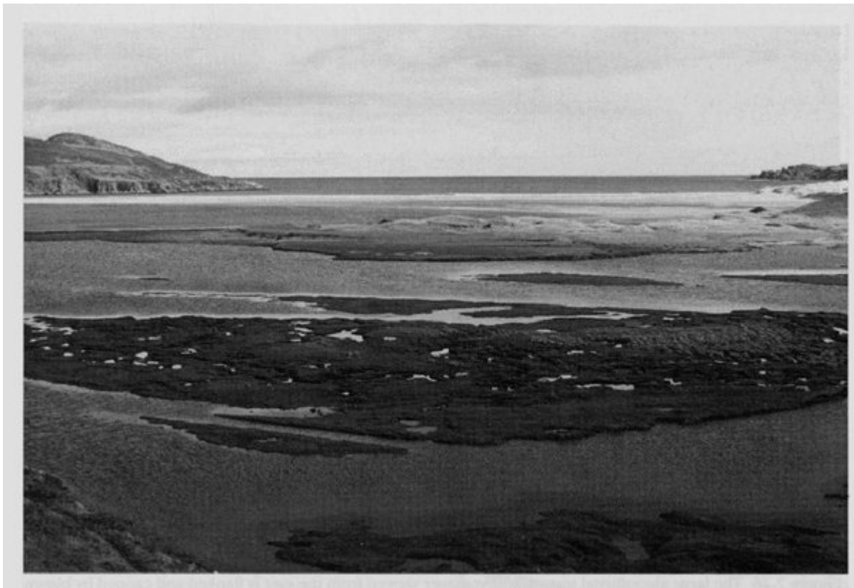
(Figure 7.27) The intertidal saltmarsh and sandflats of the River Borgie exit looking north-west over the low dune area and beach of Torrisdale Bay in the middle distance.