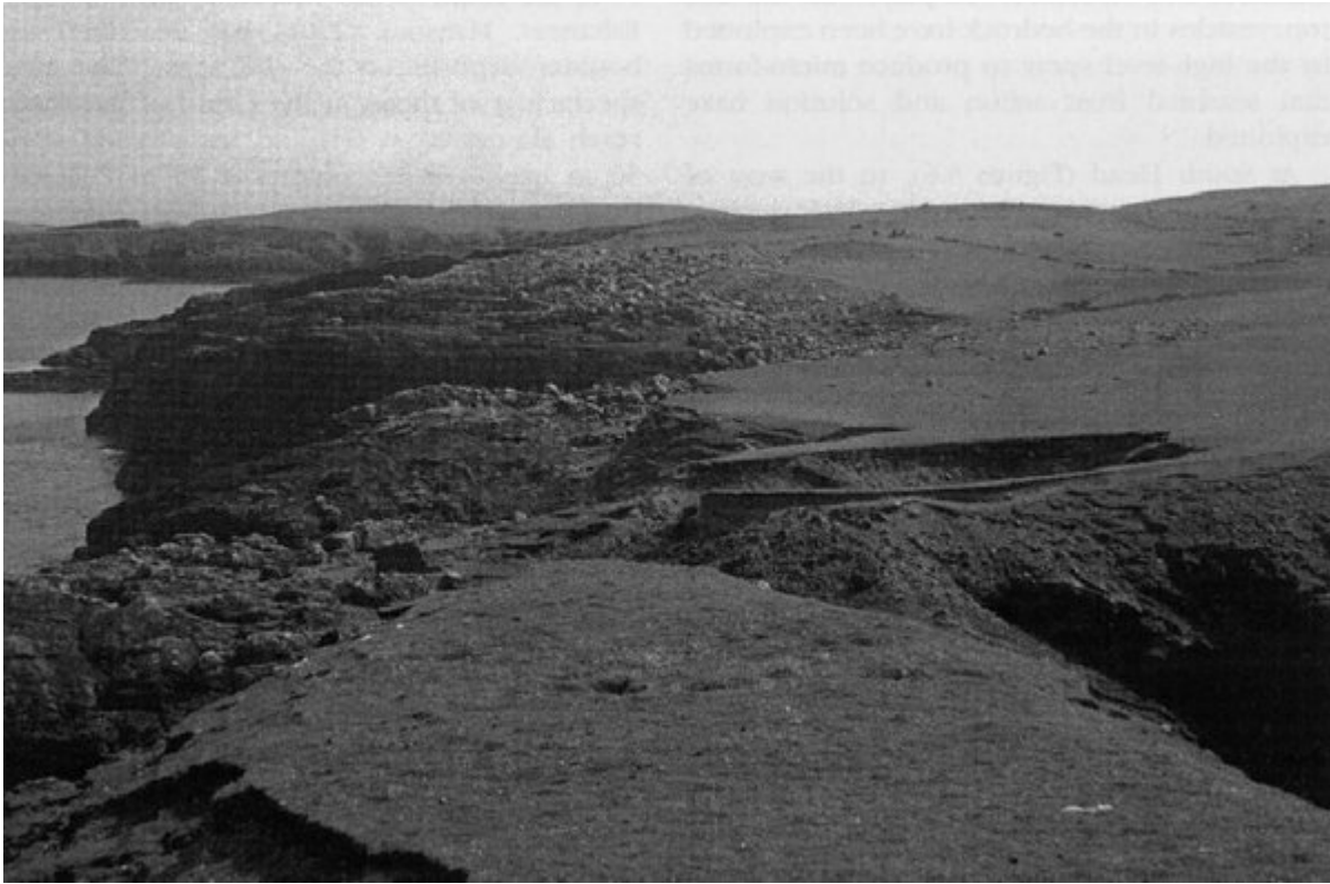
(Figure 3.6) The Villians of Hamnavoe looking north towards South Head. The scoured surface is littered with both eroded boulders and debris thrown up by waves. Since some of this debris is of modern human origin (plastic fishing floats etc.) the waves that sweep the surface and emplace the debris and boulders are likely to be recent.