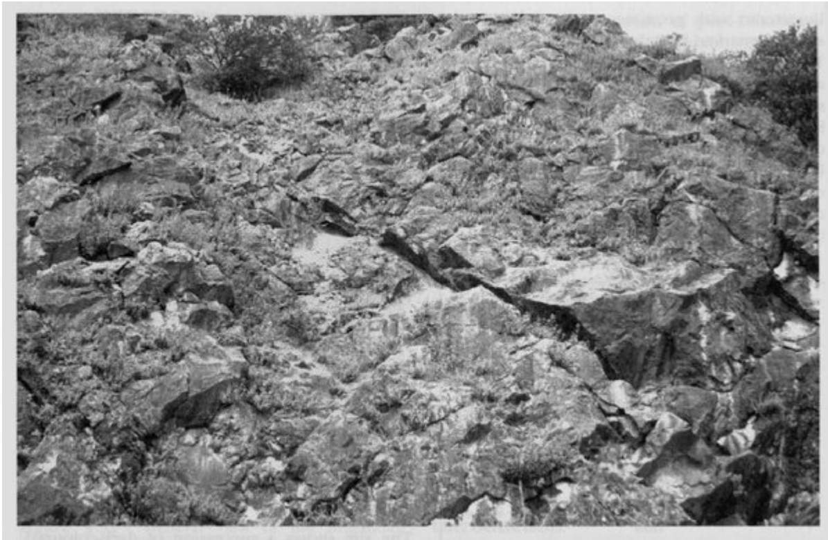
(Figure 9.29) General view of the Oxwich Head Limestone (Asbian) at Ilston Quarry. Beds dip from top left to bottom right (to the north-east). Note the presence of two prominent clay-filled solution pits (each approximately 2 m deep) on a palaeokarstic surface seen towards the centre of the illustration.