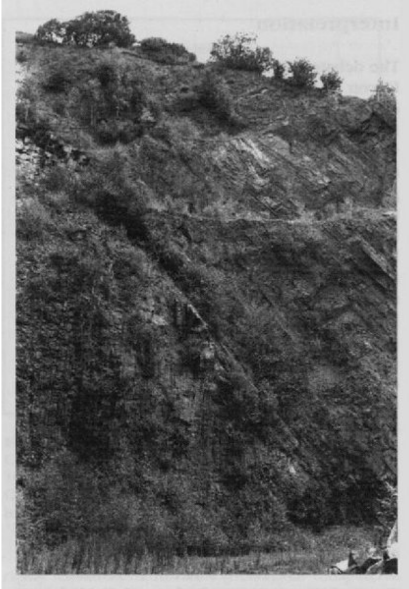
(Figure 10.8) Tight, asymmetric anticline developed in beds of the Bampton Limestone succession, Kersdown Quarry, east Devon.

(Figure 10.2) Simplified stratigraphical chart for the Lower Carboniferous strata of the Culm Trough. Compilation based on information from Seiwood and Thomas (1987), Jackson (1991) and Owens and Tilsley (1995). Much of the stratigraphical nomenclature in the Culm Trough is informal and is reproduced here according to common usage. The aim is to summarize a range of differing successions rather than imply that the rock units are well dated and have isochronous boundaries. Note that the Chert Beds and the Bealbury Formation in the Crocadon Formation of the St Mellion Klippe may be olistoliths or isolated thrust-bound units; see Viverdon Down Quarry GCR site report (this chapter) for further details. Half-arrows represent thrust faults. Stour. Fm — Stourscombe Formation. Not to scale.